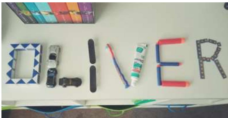
Above: Year 3 and 4 have also been creative. Making their names out of items found around the home.