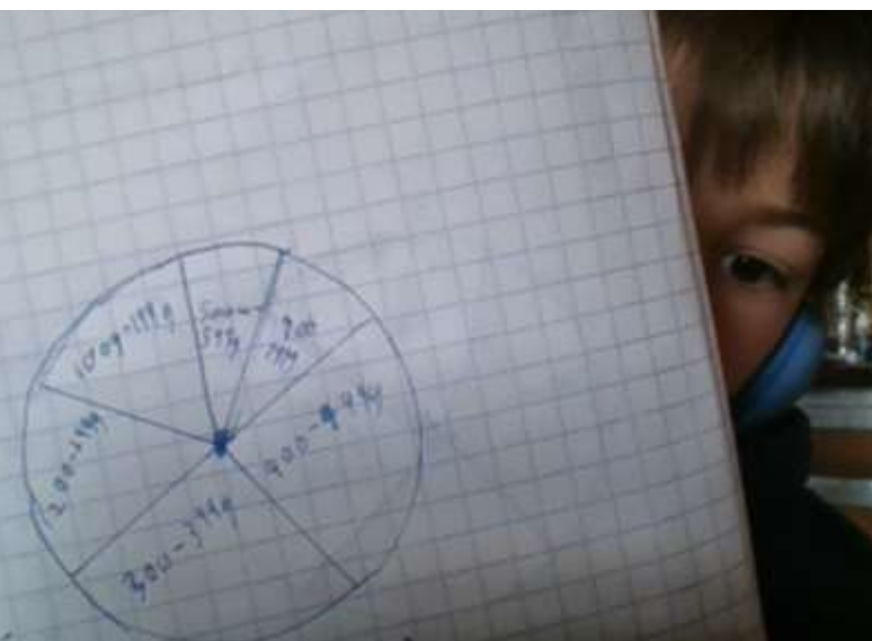
Above: They have taken many measurements on their potatoes. They have compiled the data. (as a shared document on screen where they annotate). And they have produced many graphs of their data. Leigh's Pie Chart.