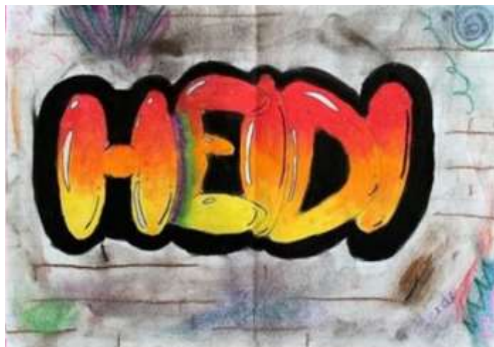
Above: Year 5 & 6 have undertaken some graffiti art. Heidi's graffiti art name wall.