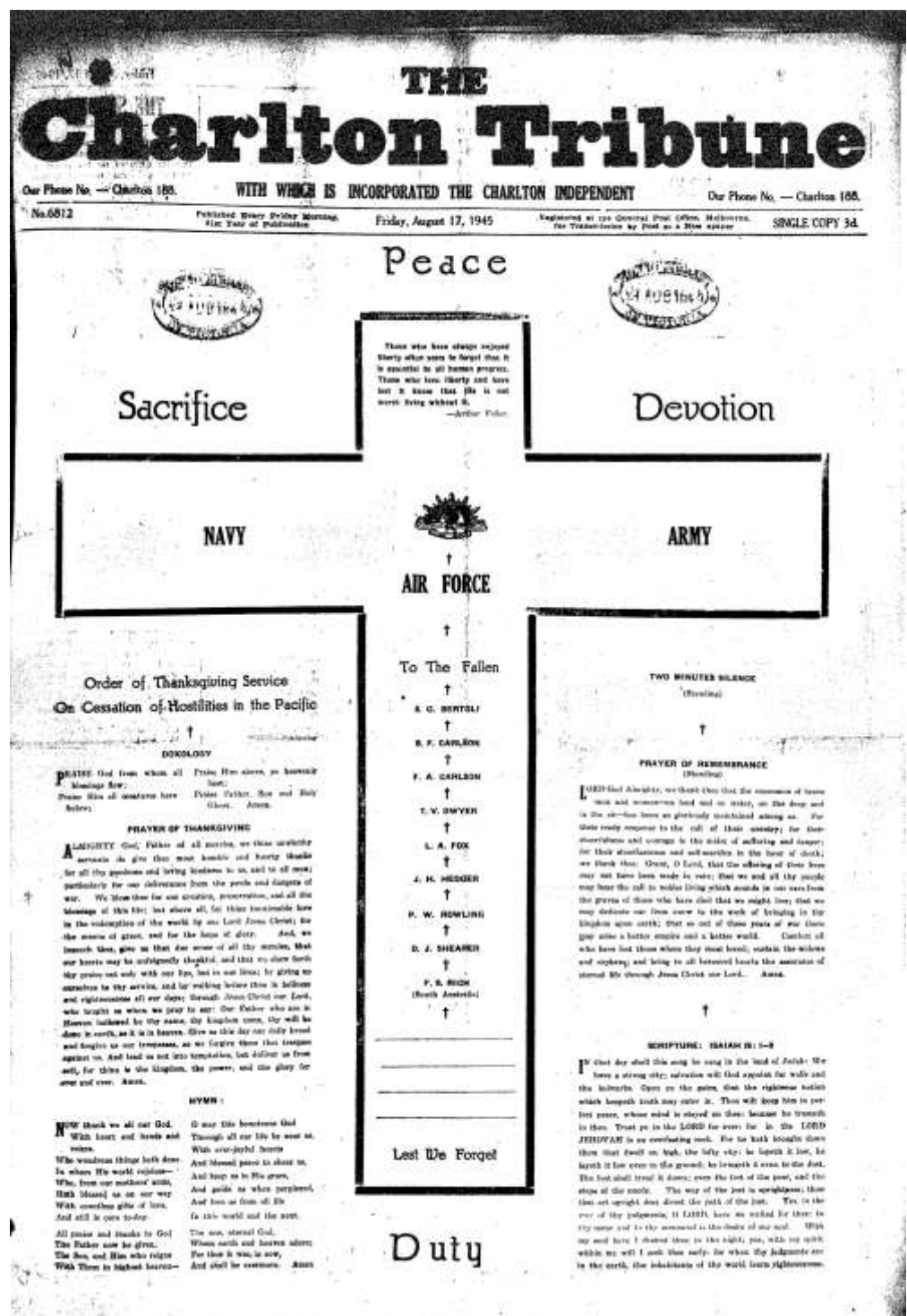
Right: The front page of the Charlton Tribune declaring the end of World War 2.