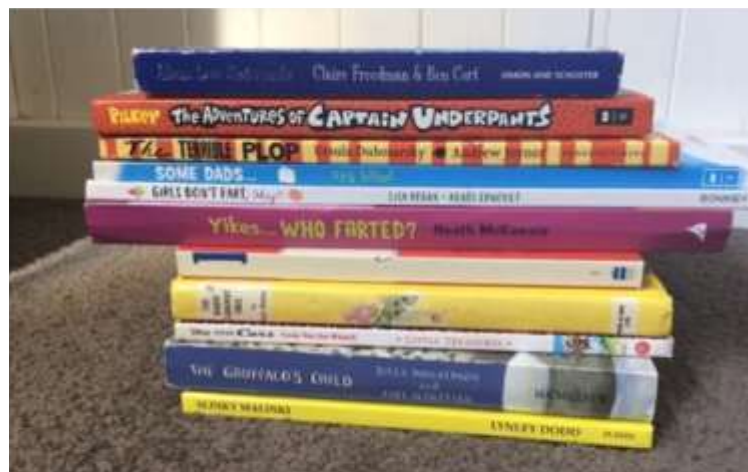
Above: Year 2 were looking at poetry and created a poem from a stack of books. Left—Fatiha's stack book poem. Right—Sam's stack a book poem.