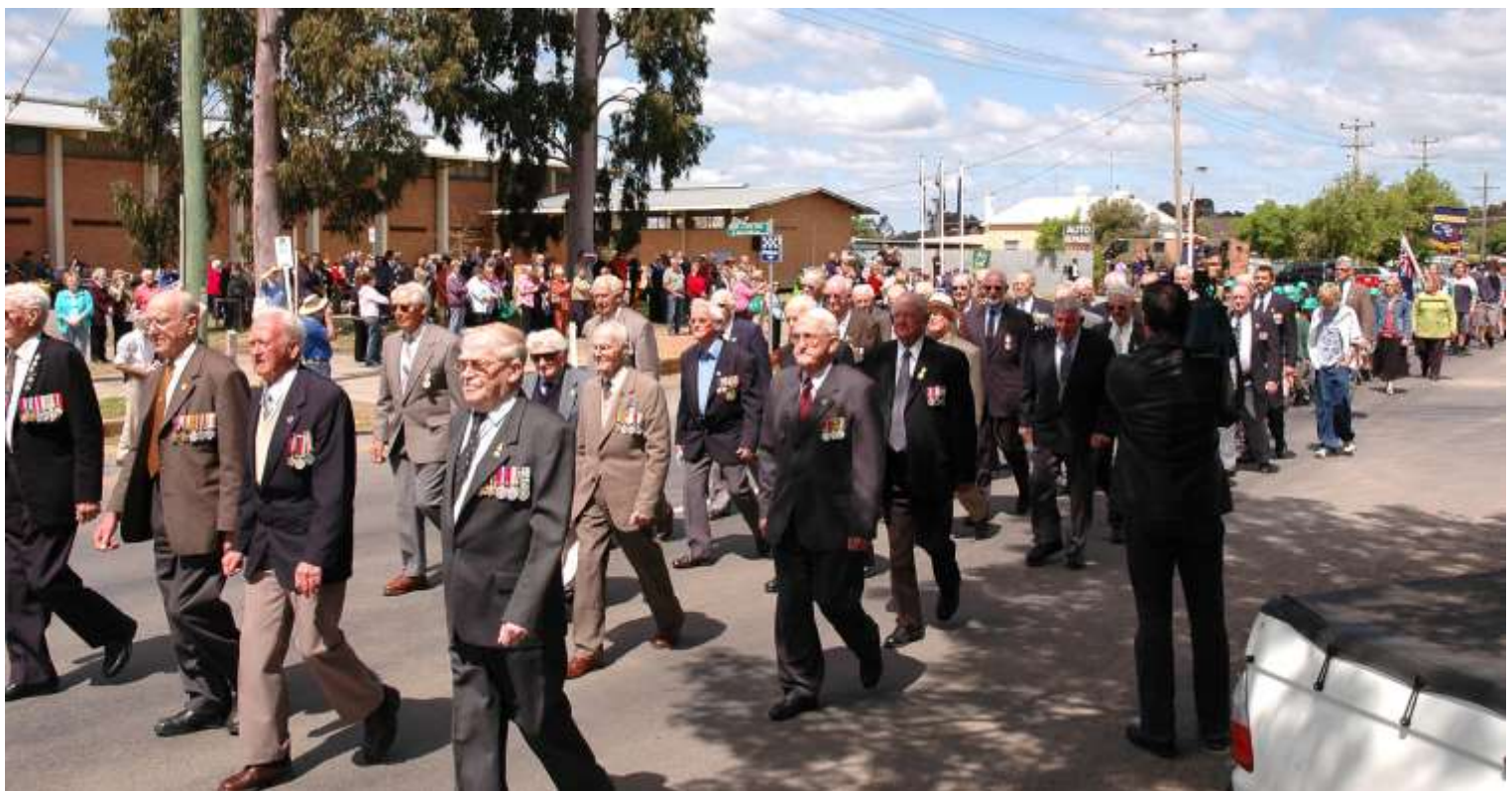
Above: A large contingent of RSL members are pictured marching at the 60 th anniversary commemoration in 2005.