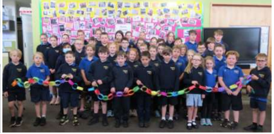
We also made a chain to signify that we are all back together. Students pictured with the chain in front of the board of photos from the remote learning period. This chain now hangs proudly in our entrance window.