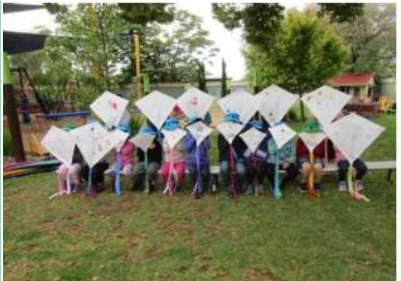
Charlton Preschool showing off their fantastic decorated kites.

The Neighbourhood House has also celebrated Children's Week (October 26 to November 1) with a donation of kites to primary school aged children or younger. Our initial hope was to hold a kite flying day, but with the unknowns of COVID-19 restrictions, Grant funding from the Victorian State Government instead went to the purchase of kite kits the children could enjoy decorating and flying.