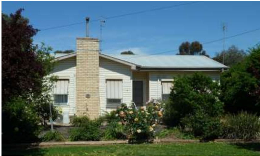
EVERYTHING YOU COULD WANT