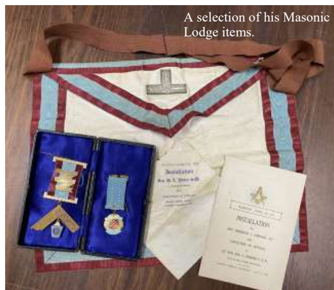
A selection of his Masonic Lodge items.