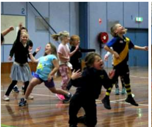
Above: Year 2 playing their air guitars.

Students from Charlton College, along with St Joseph's undertook a week of Stomp Dance sessions. Each group of students learnt four different dances throughout the week. This culminated in a performance on the Friday.