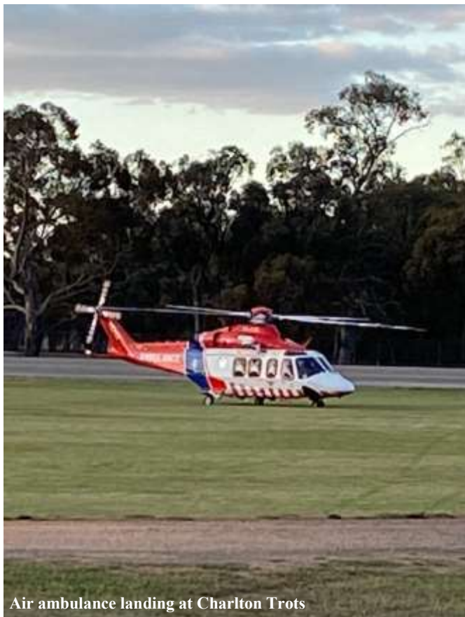
Air ambulance landing at Charlton Trots