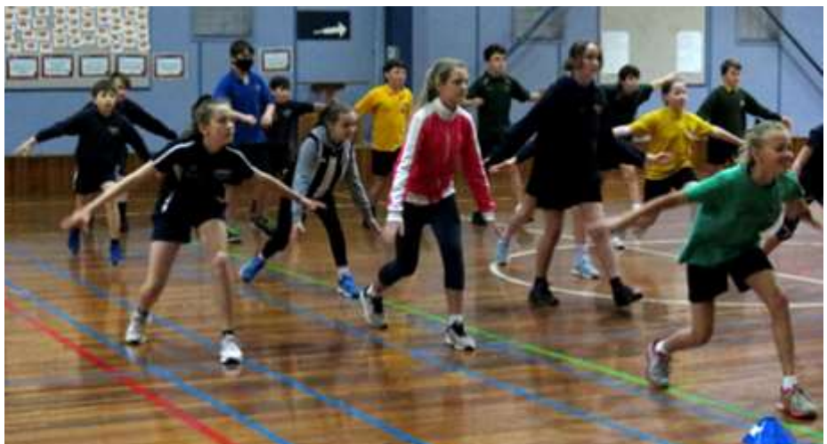
Above: Year 5 & 6 performing.