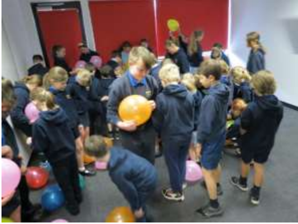
One of the activities required students to find a balloon with their own name amongst those of all the other students.

On Thursday the 8 th of October, Charlton College F-6 students returned to on site learning after the second round of remote learning for 2020. There was a real buzz in the air and staff had prepared the building and some welcome back activities for the students.