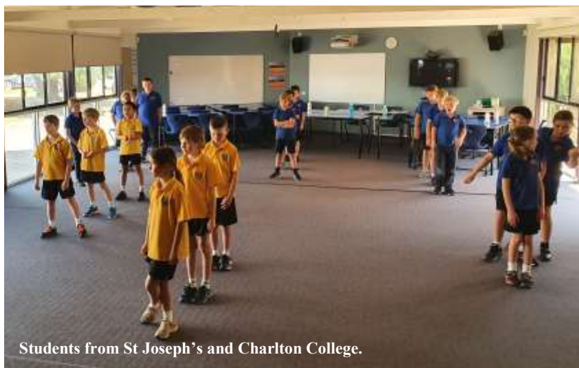
Students from St Joseph's and Charlton College.