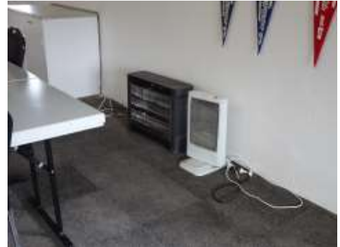
Above: The old evaporative vents and the bar heaters from the ceiling & the fan heaters we used to use to keep warm on meeting nights.