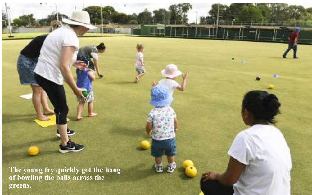
The young fry quickly got the hang of bowling the balls across the greens.