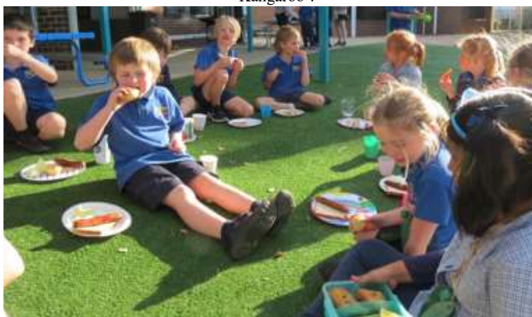
Tea consisted of snags, ham and cheese damper and salad. For dessert students ate lamingtons that they had made themselves, yum, yum and fresh fruit!