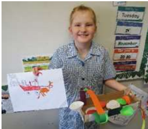
Lacey's design included a line for hanging up Santa's suit, a shower and a bed. The sleigh would be pulled by a kangaroo.