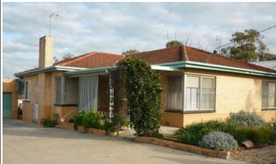
CLASSIC CREAM BRICK