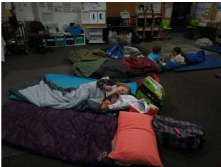
Year 2 settling in for bed.