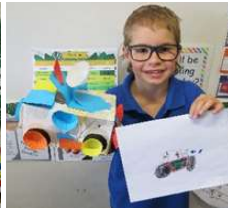
Sam's design featured turbo boosters and is able to go across water by turning into a boat.