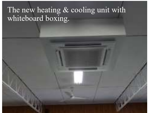
The new heating & cooling unit with whiteboard boxing.