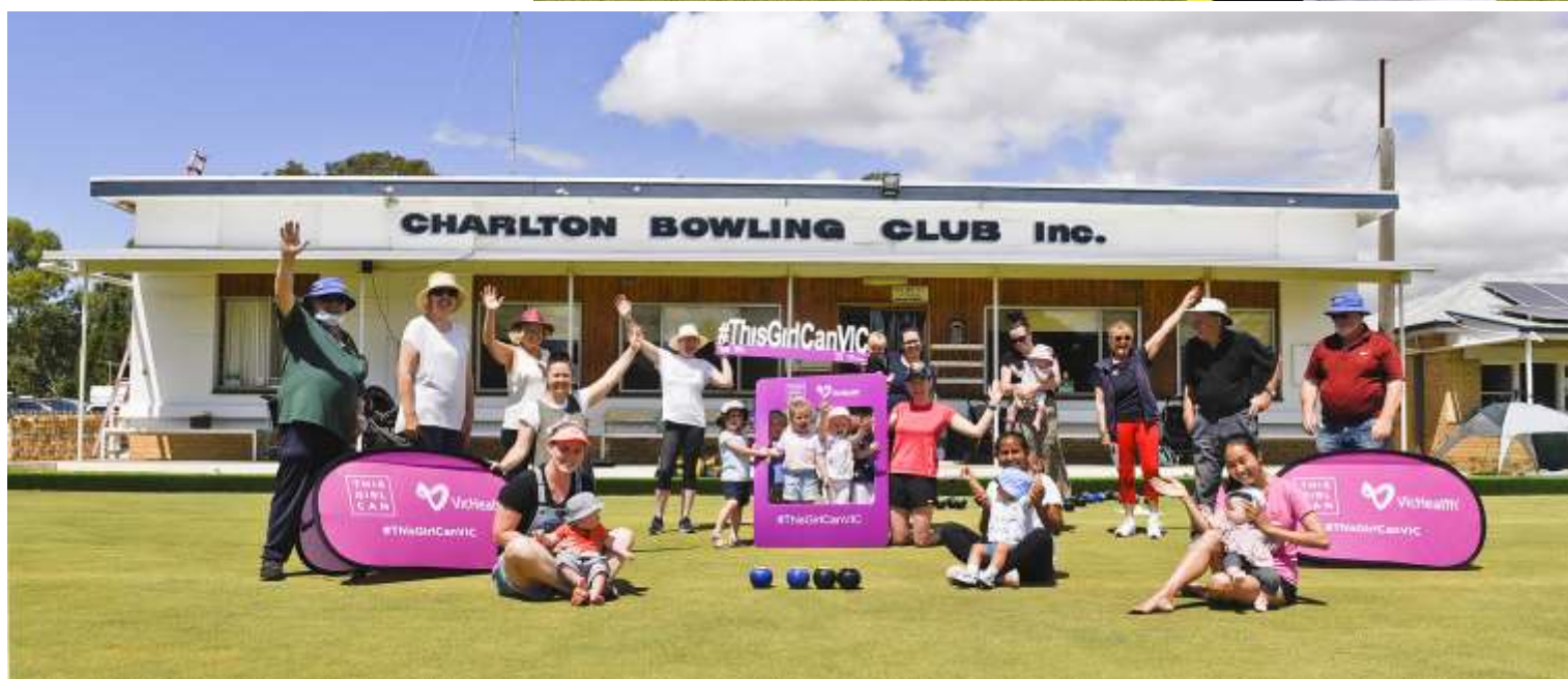
Above: Participants celebrated the "This Girl Can" event held recently at the Charlton Bowling Club.