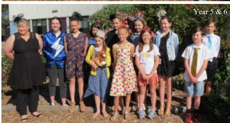
Year 5 & 6

The 2020 Foundation students have finally attended 100 days on site. On Thursday 19 th of November, with the assistance of Year 1, they celebrated this occasion with many fantastic activities and an extra special shirt that said "How did we survive 100 days of school?".