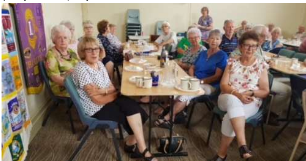
Above: Watching the Andre Rieu 2008 DVD at the Lions Lodge.