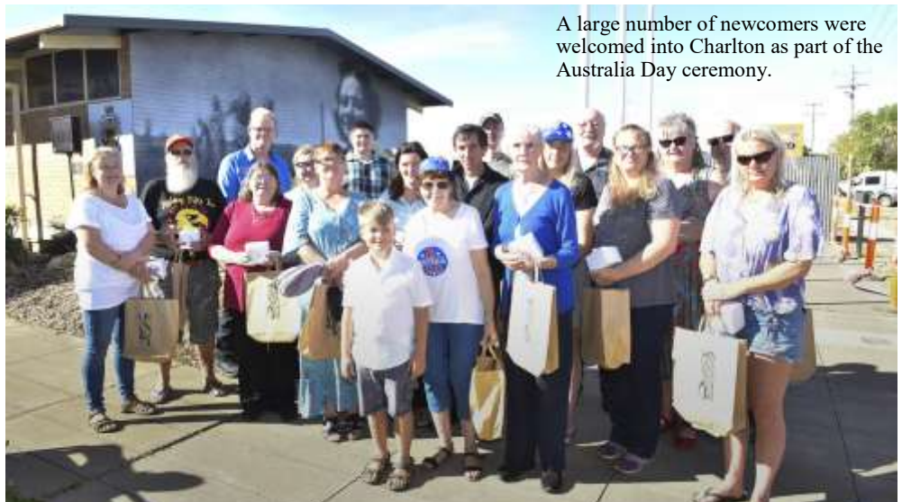
A large number of newcomers were welcomed into Charlton as part of the Australia Day ceremony.