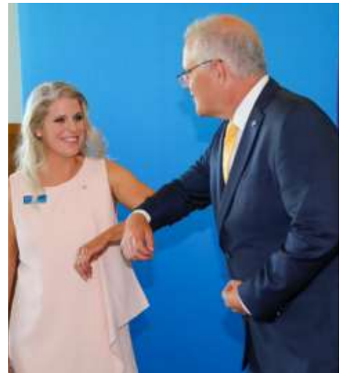
Above: Kirby with Prime Minister, Scott Morrison.