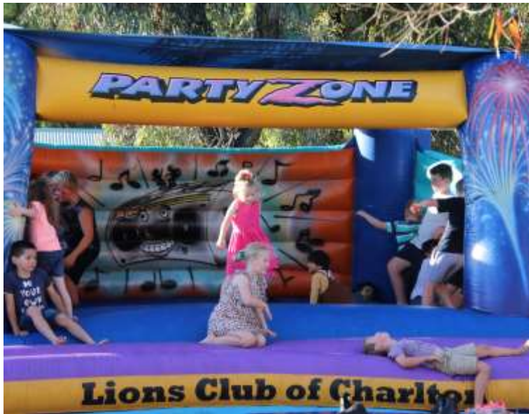
Above: The raffle prizes worth over $2000. Left: Youngsters enjoying the Lions Club jumping castle. Below: some of the crowd enjoying the festivities. Bottom: The Charlton-Wycheproof Citizens Band enjoying the opportunity to play in public again.