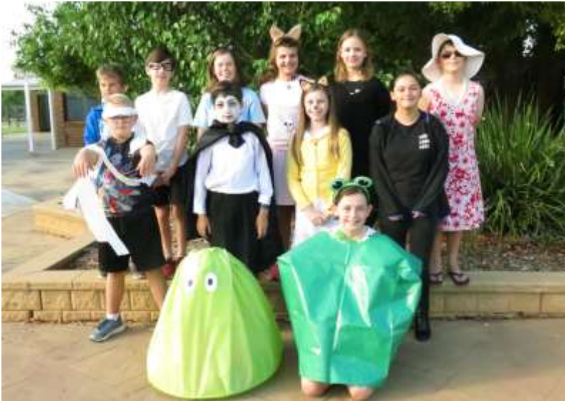
Year 5&6: Hotel Transylvania