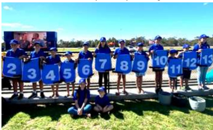
Above: Junior Members Numbers Presentation.