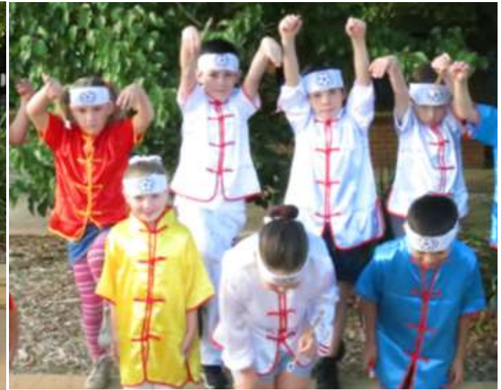
Year 2: The Karate Kid