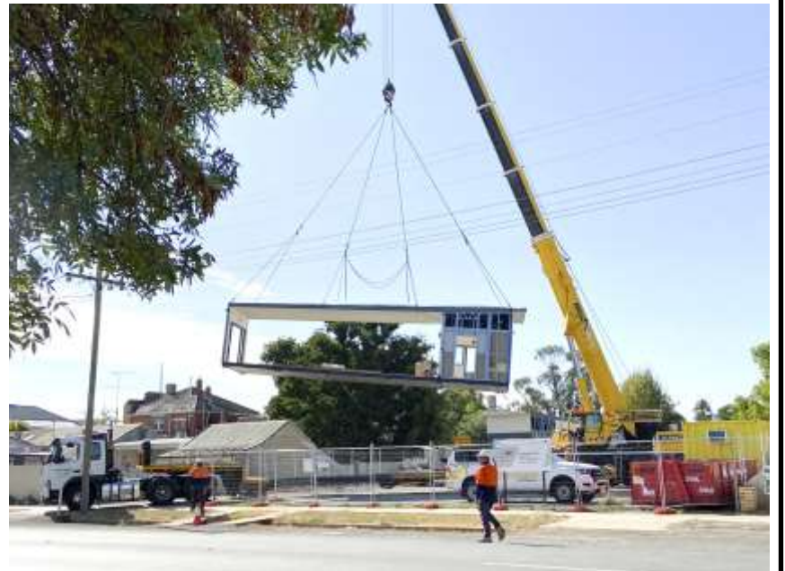
Above: Raising the module off the long loader.

It is anticipated that the building will be ready for use in Term 2.