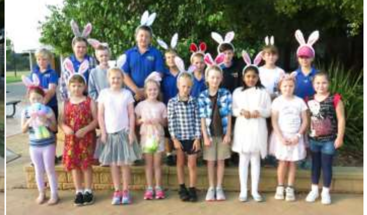
Year 3&4: Hop.