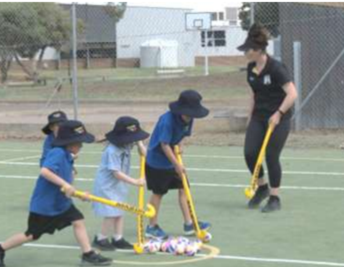
Students 'stealing the eggs'