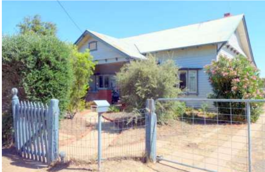
CLASSIC CALIFORNIA BUNGALOW