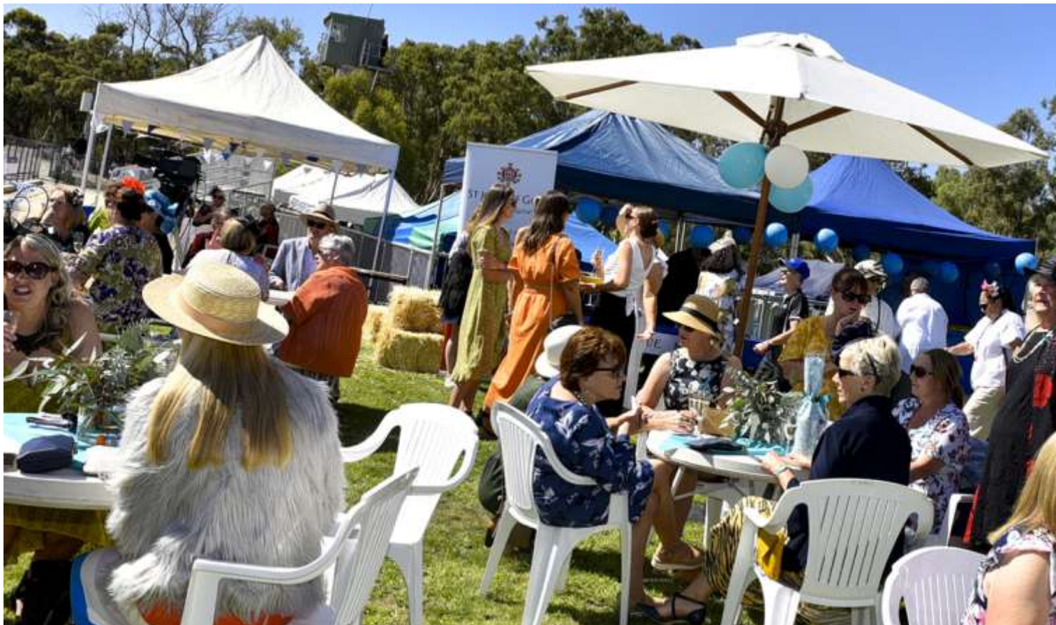
Above: The scene as “Bubbles in the Bush” launched the Charlton Pacing Cup day. Patrons turned out to support the Ovarian Cancer fundraising event which raised $4,000 on the day. 2021 marks the fourth year St. John of God Bendigo Hospital has provided support for this worthy event.

As the afternoon progressed, the eagerly anticipated “Fashions on the Field” attracted