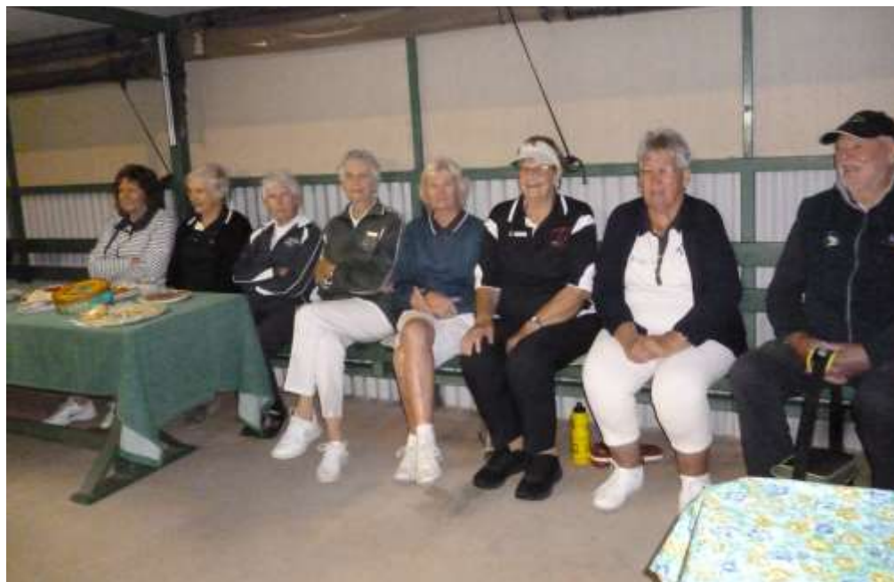
Golf Croquet Social Evening.