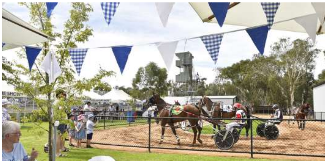
The new Parade Ring—Photo by Jenny Pollard.