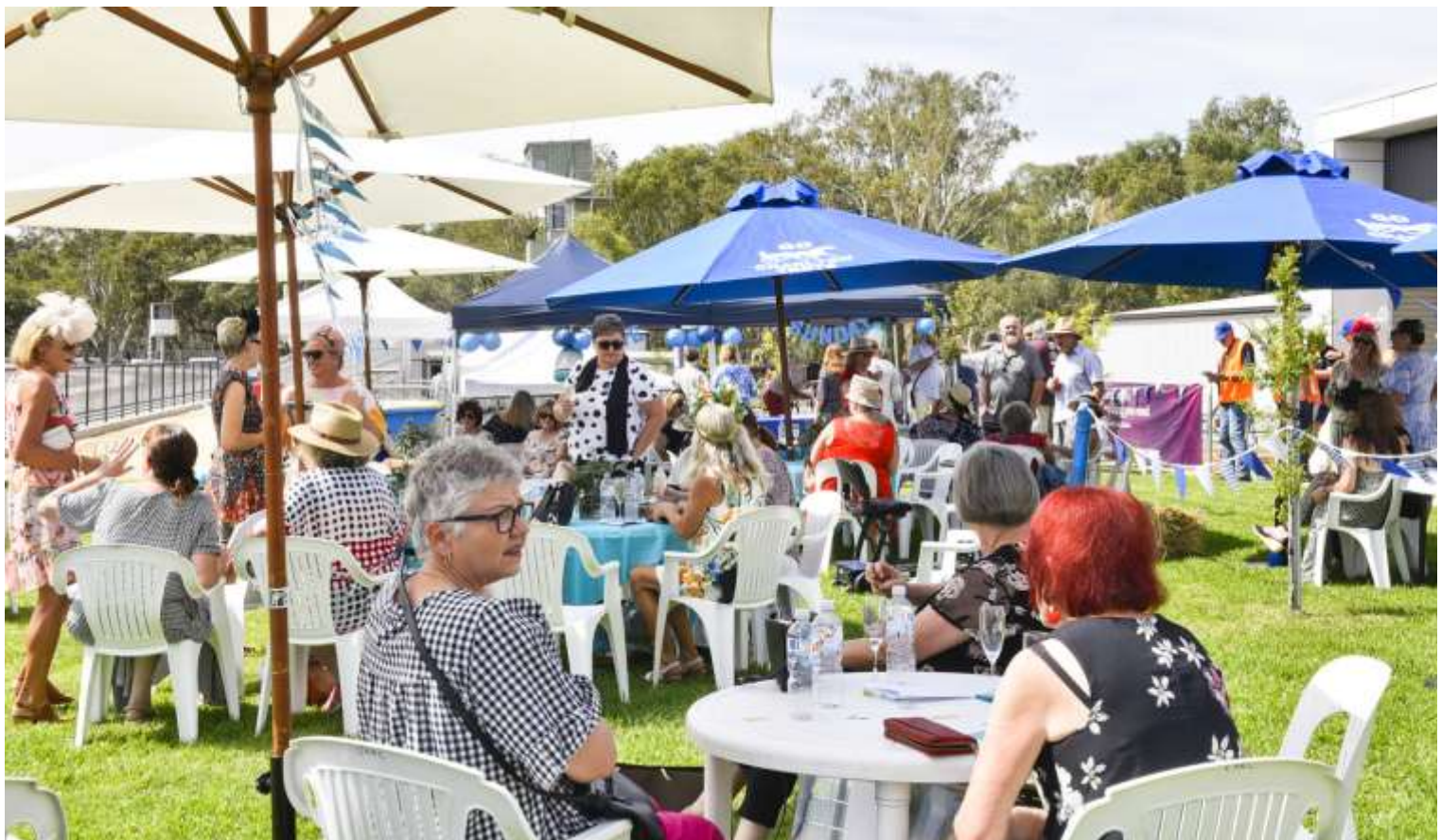
A view of the crowd during "Bubbles in the Bush".