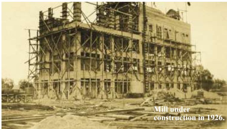
Mill under construction in 1926.