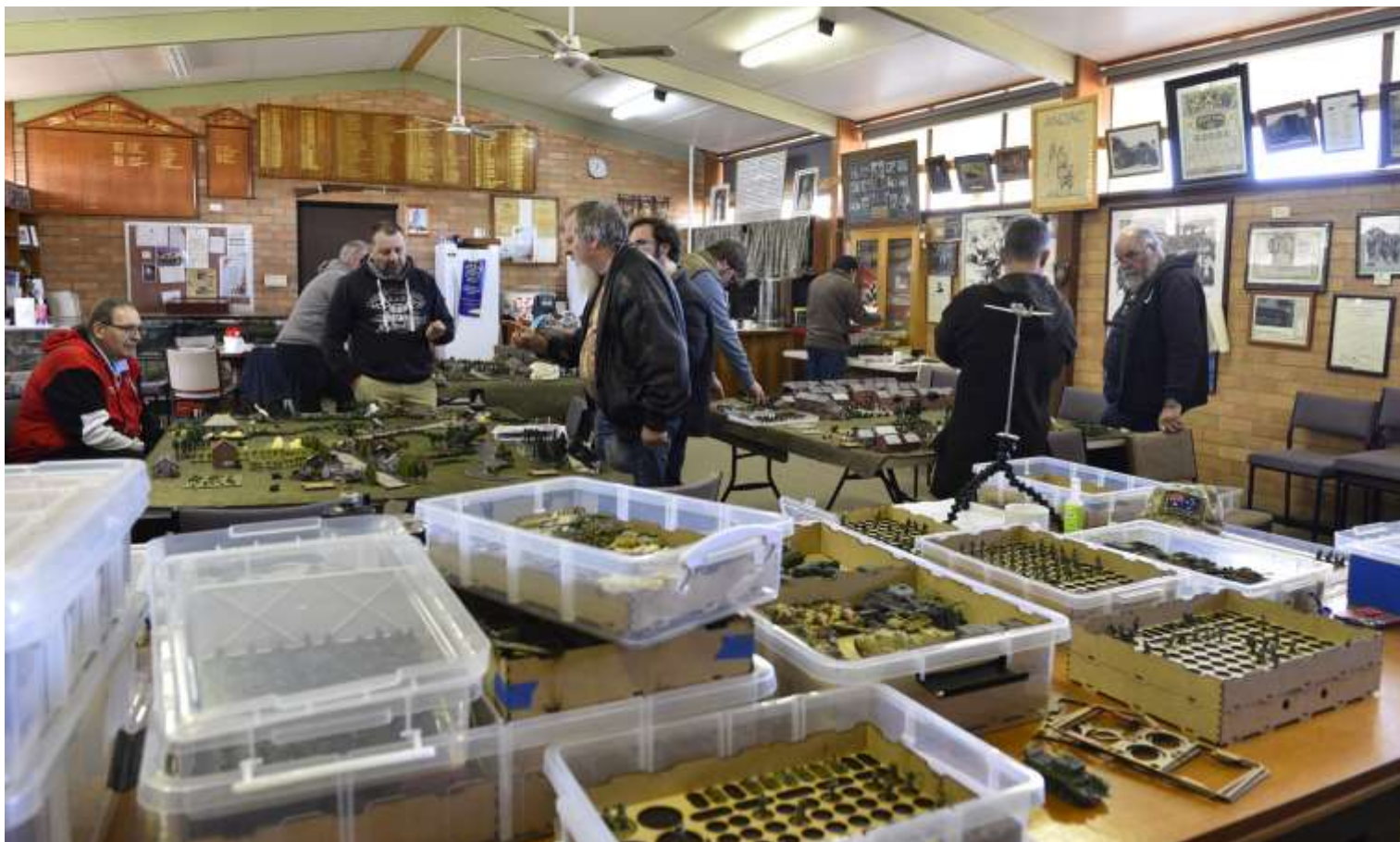
The scene is set as participants focus on the three tables laid out with the stages of the Battle of Arnhem. In the foreground are some of the boxes of miniature figurines, vehicles and other items used in the battle scenario.