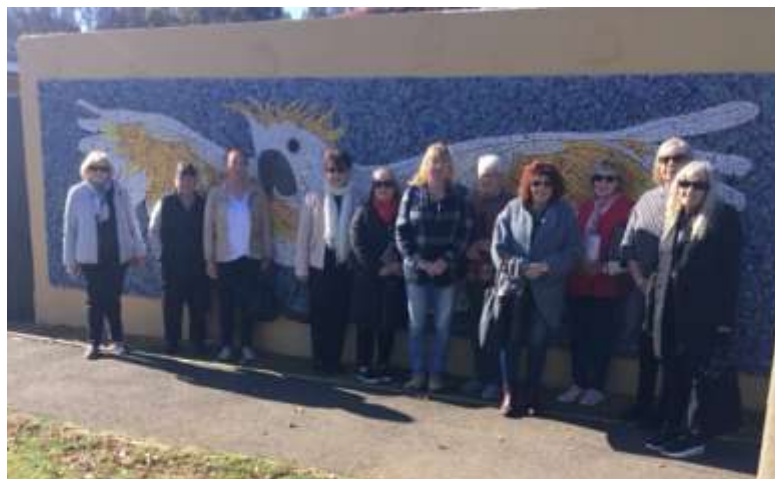
Members in front of the mosaic mural in Wedderburn.

Enquiries Bernice 03 5491 1334, Sue 0407 140 336.