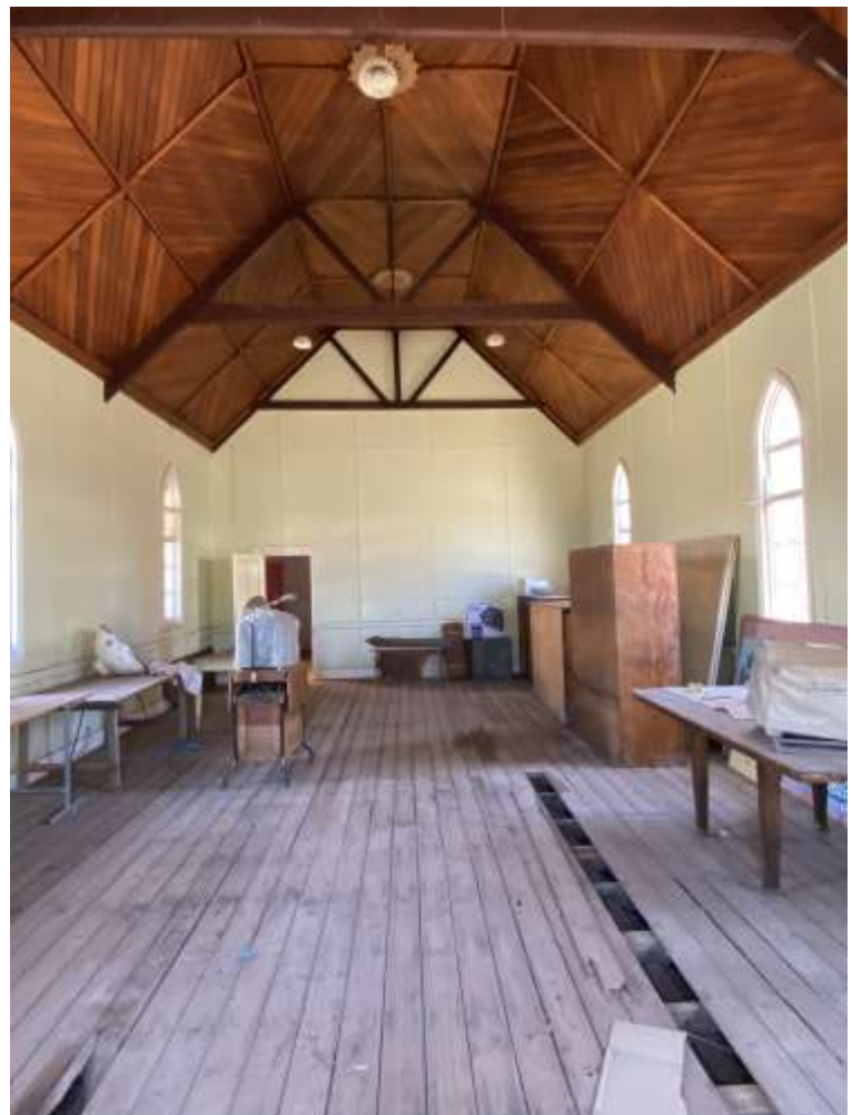
The interior of the Wesleyan Chapel. Floor repairs are the most immediate issue.