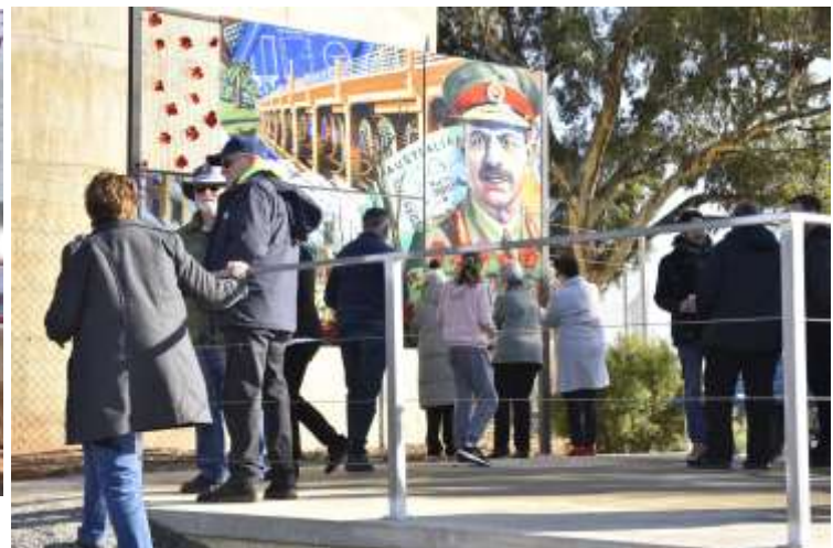
Following the opening, the crowd was invited to place a poppy on the newly erected mural.