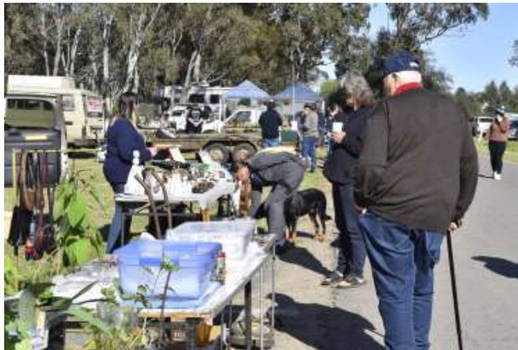
Everything from plants to pre-loved treasures made for plenty of choices as the crowd built during the morning.