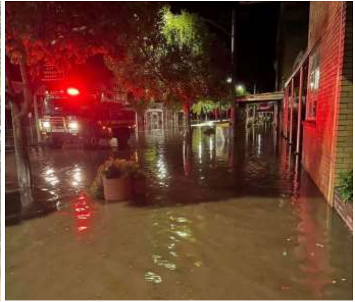
Sunday night in High Street.