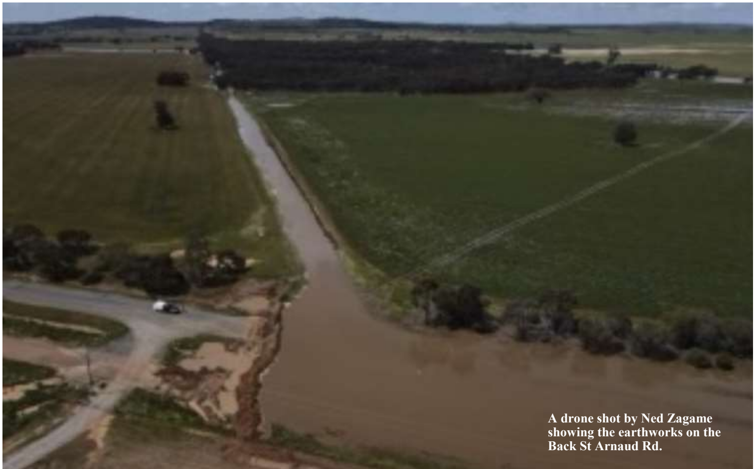
A drone shot by Ned Zagame showing the earthworks on the Back St Arnaud Rd.

The district's farmers were also impacted with loss of crops, particularly hay crops due to the continuing wet weather, and major damage to many roads.