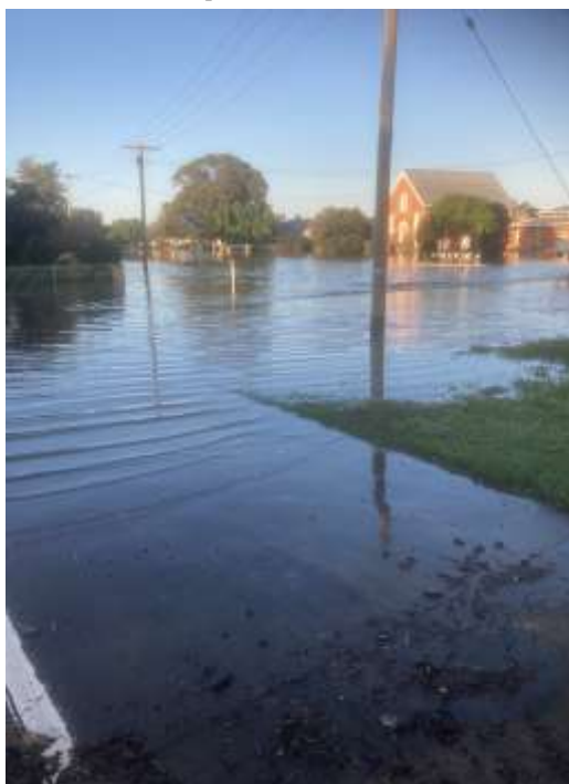
Cnr of High and Halliday Streets.