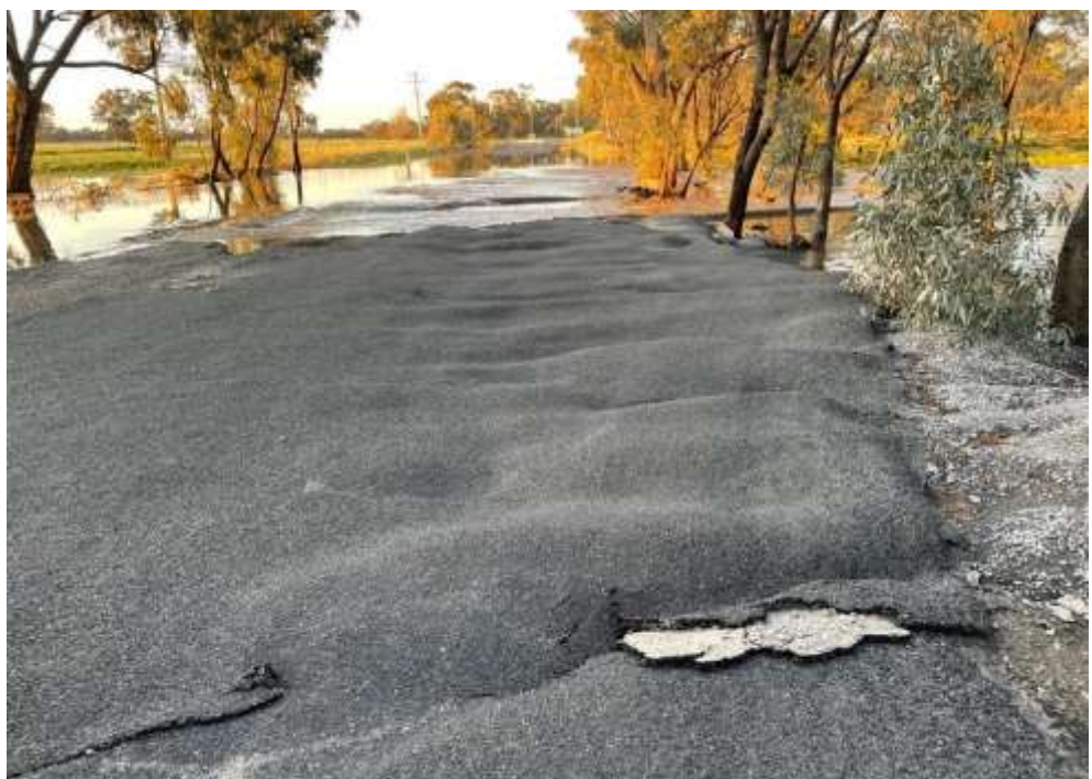
An example of some of the road damage in the district—Yeungroon Rd.