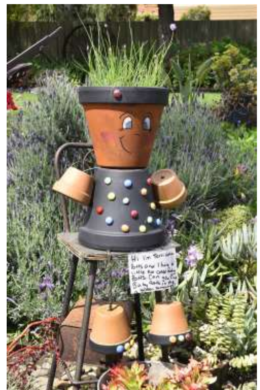
The delightful Terracotta Pot Person in the Nicolson family garden