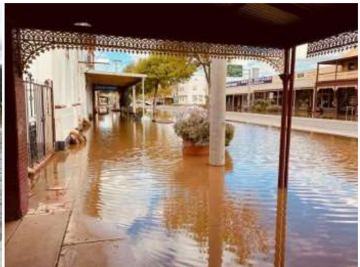
High Street on Monday morning.