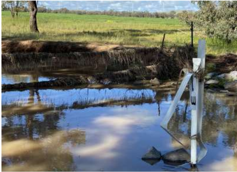
The Yeungroon Creek road crossing at Yeungroon.