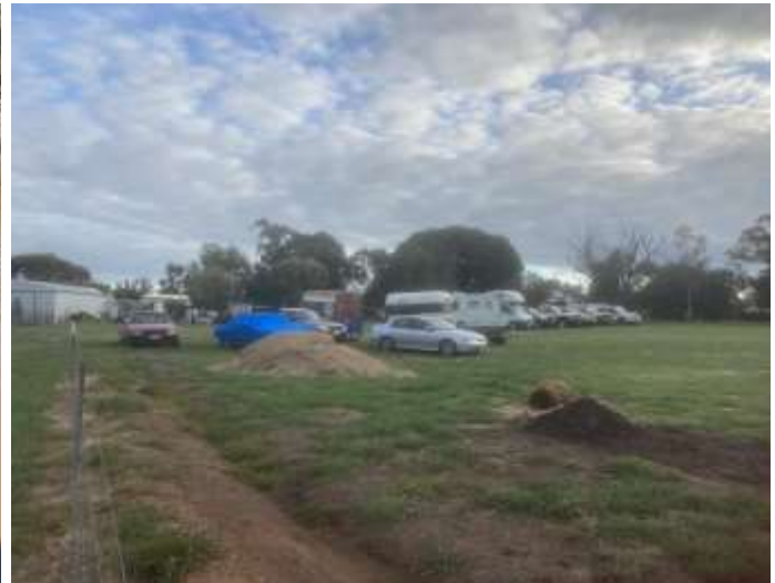
Vehicles parked up on higher ground.