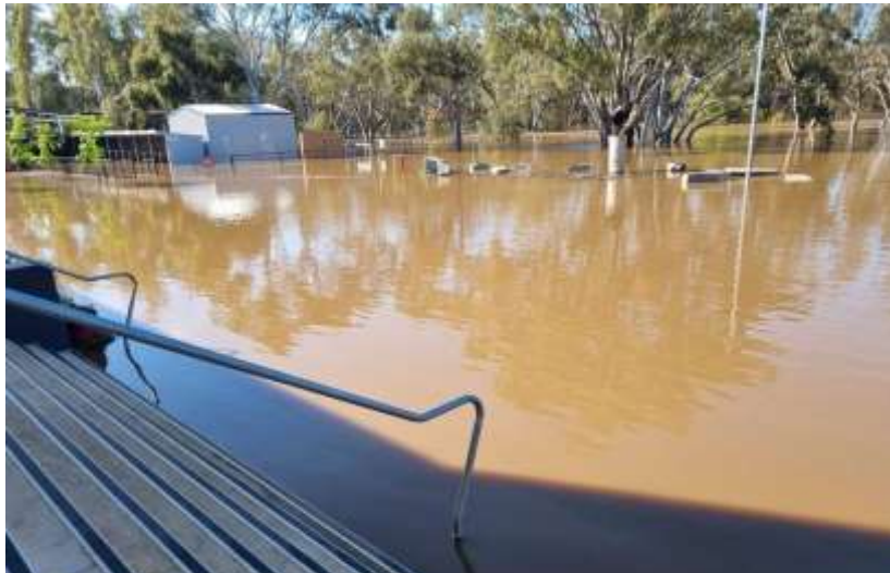
Charlton Park car park.