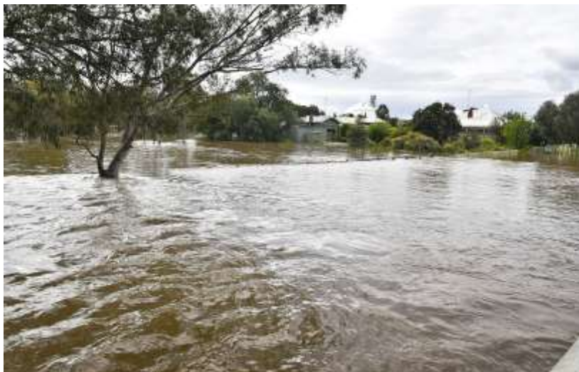
The view from the James Paterson Bridge (5pm Saturday) as the Avoca River continued to grow in size.