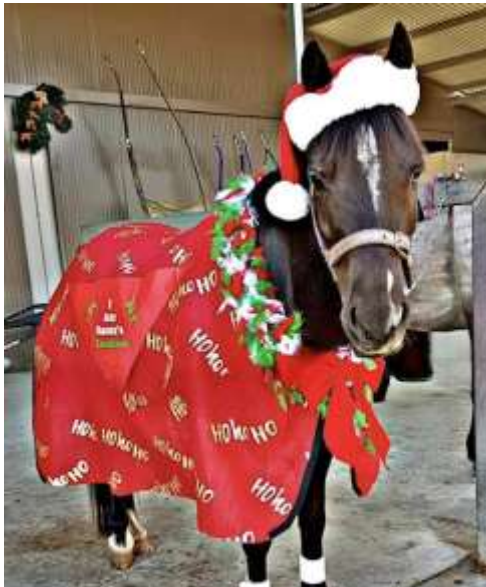
Club mascot—Agent T.

We thank Agent T, our club mascot, for helping to promote this night and we hope to see lots of our members attend for a great night together.