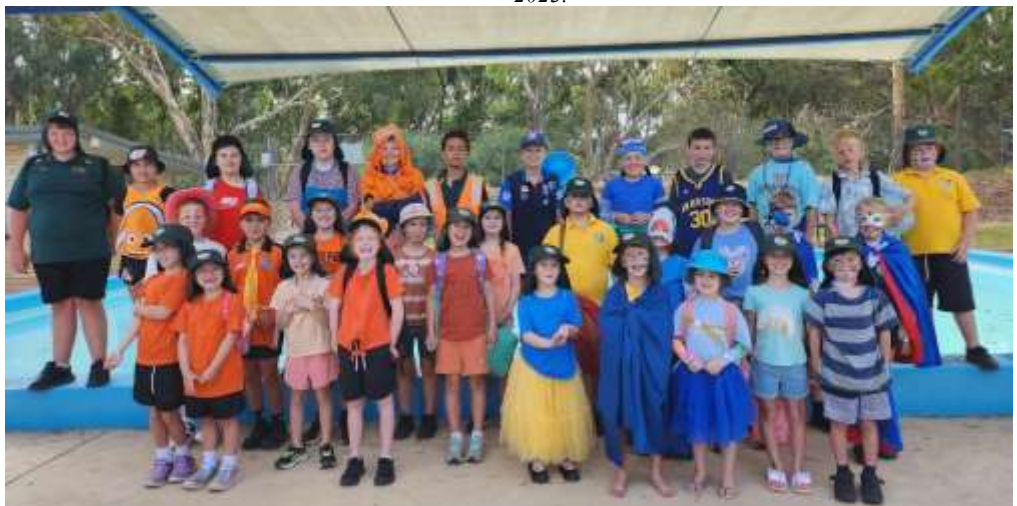
Team Nemo and Team Dory in their team colours before we began.