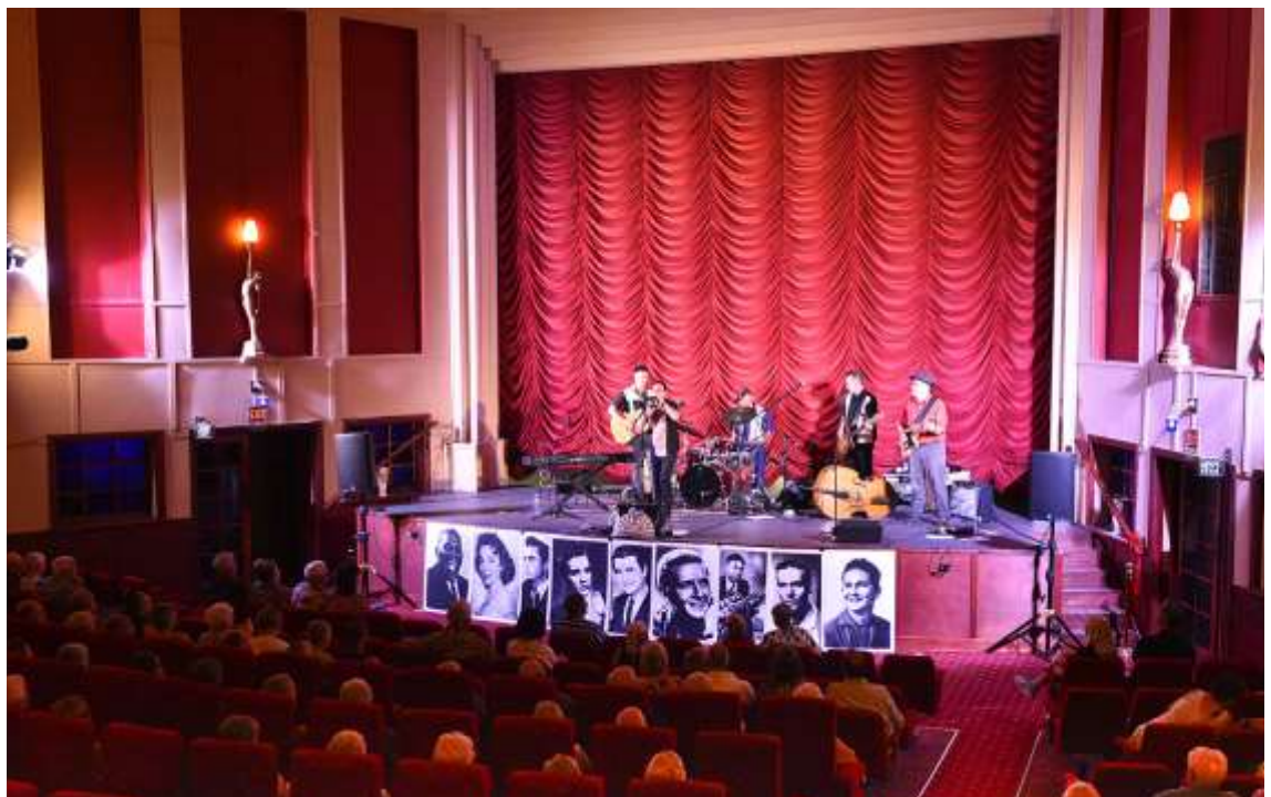
Despite an eventful journey to Charlton, the Sun Rising band lit up the Rex stage last Friday night with their powerpacked homage to the greats of the Sun Records recording studio. The appreciative crowd was reluctant to let them leave at the conclusion of the night.