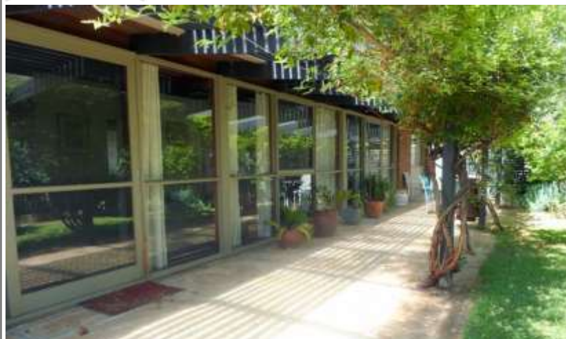
2 ACRES – BEAUTIFUL BRICK HOME WITH POOL PERFECT IN EVERY WAY!

Julie Benaim 0457 904 119 Real Estate sales window at 31 High St Charlton Office 33 High St Wedderburn admin@p1property.com.au