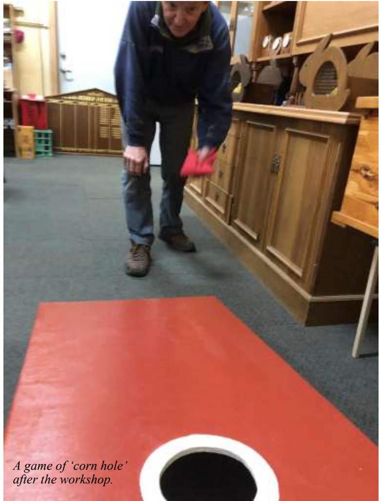
A game of 'corn hole' after the workshop.