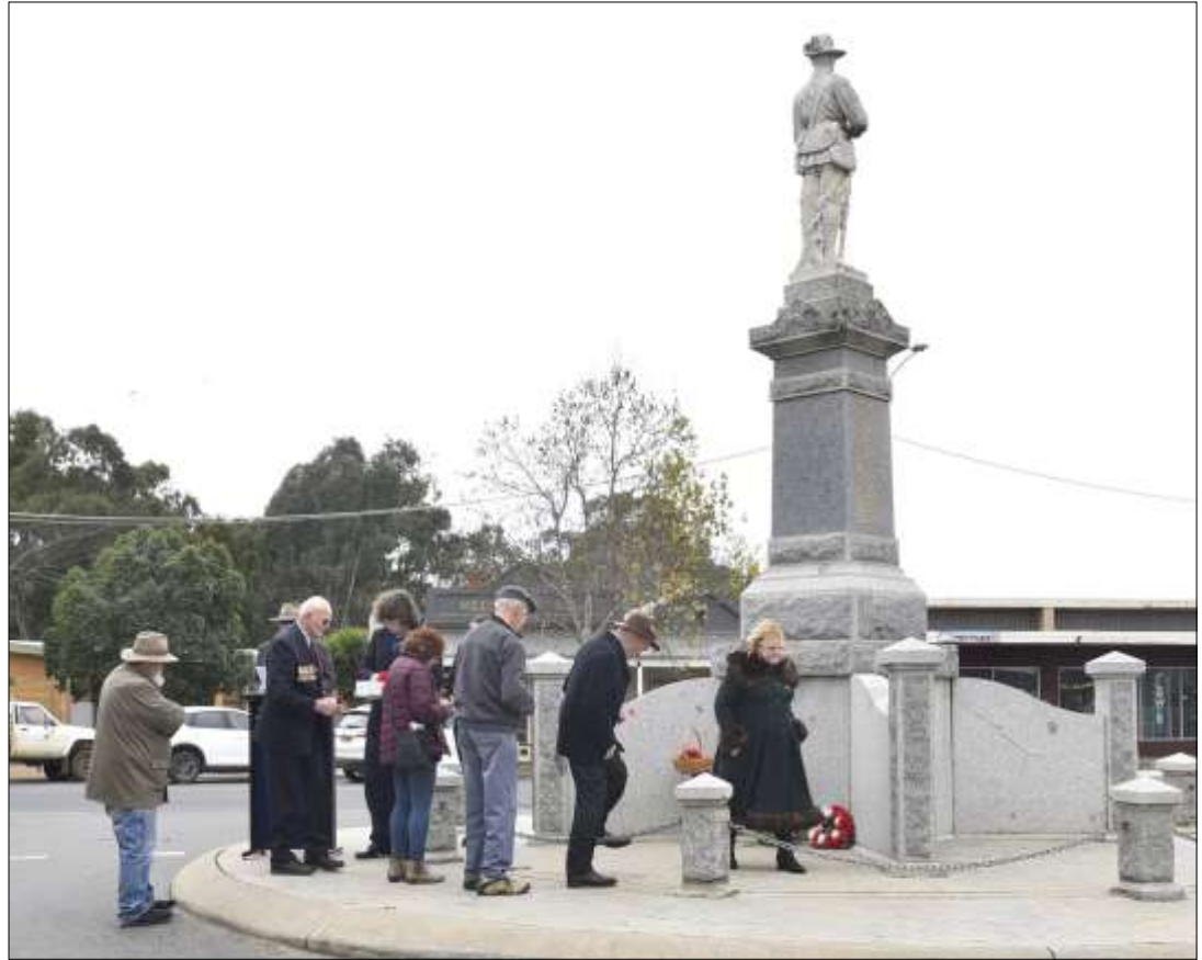
Members of the public were also invited to lay tributes to the fallen at the centoph.

Much positive feedback was received about the show, and the girls were particularly generous with their time, meeting and talking with audience members following the performance.