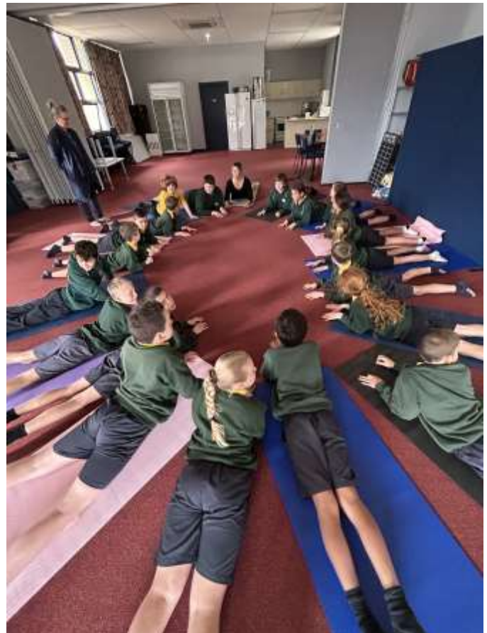
The senior group participating in the Yoga session