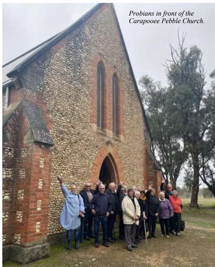
Probusians in front of the Carapooee Pebble Church.