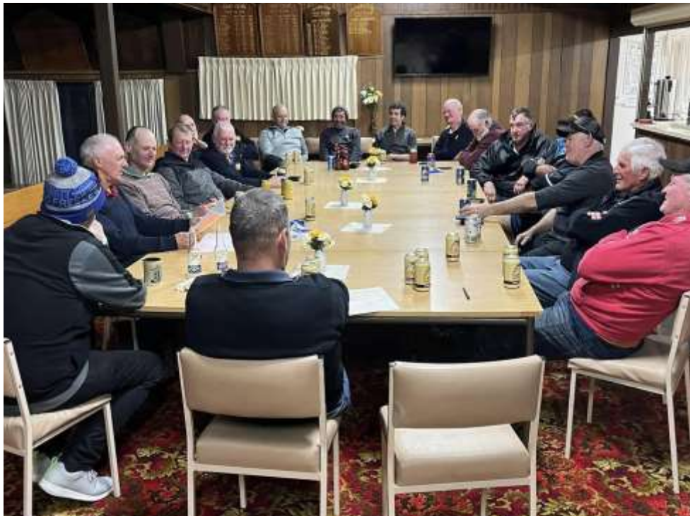
The men enjoying a post competition drink in round two of the championships.