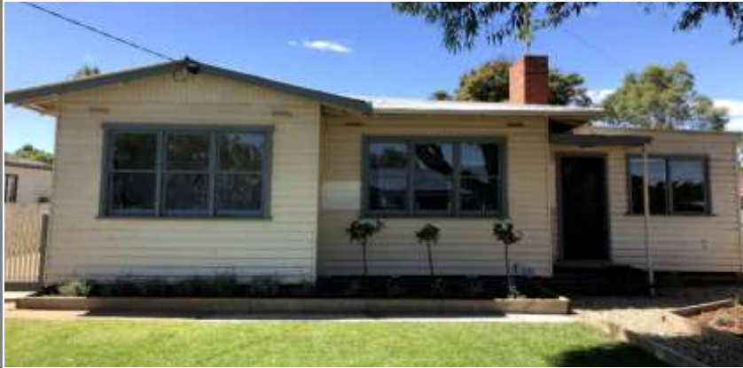
This three bedroom fully renovated home is perfect. Fully renovated in a great location, enclosed yard with a large Colorbond shed with power and concrete floor. Situated on a corner block with side entry.

Julie Benaim 0457 904 119 Real Estate sales window at 31 High St Charlton Office 33 High St Wedderburn admin@p1property.com.au