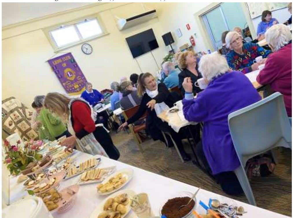
The mid-winter weather didn't deter the crowd, as the Lions Lodge filled up with many willing to support this important cause.