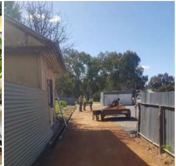
The Globe laneway.