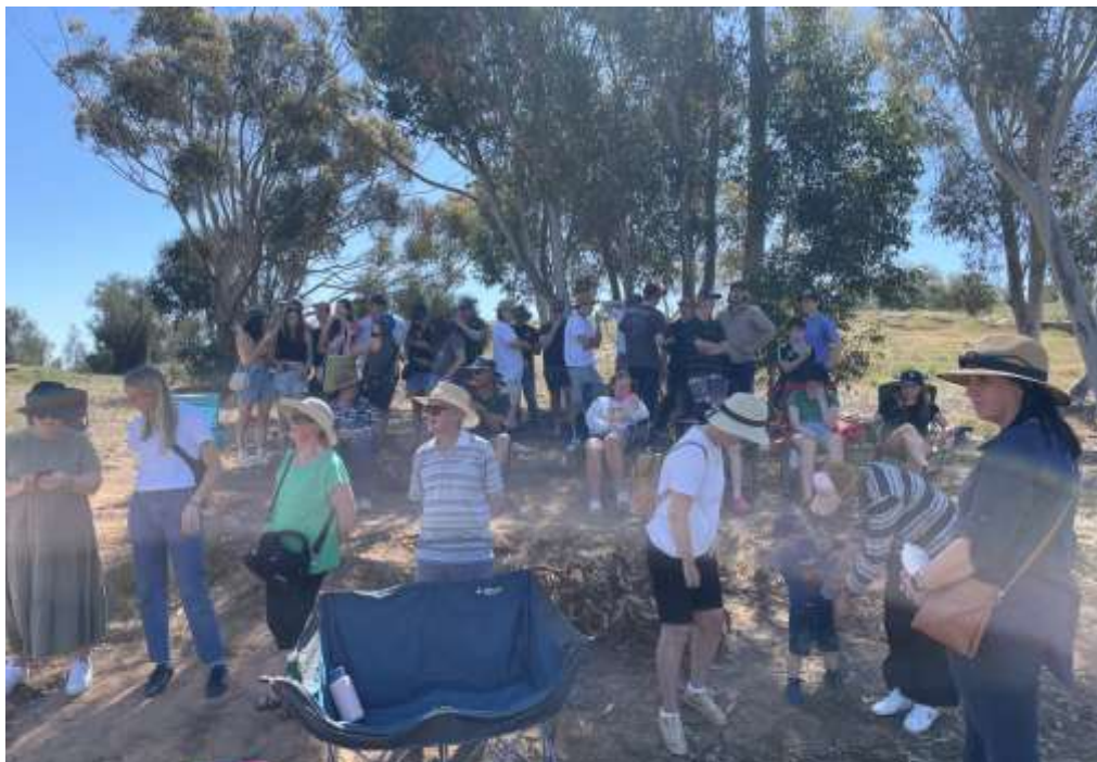
Some of the huge contingent of Charlton supporters.