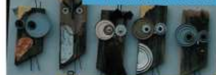
A riot of Kookaburras