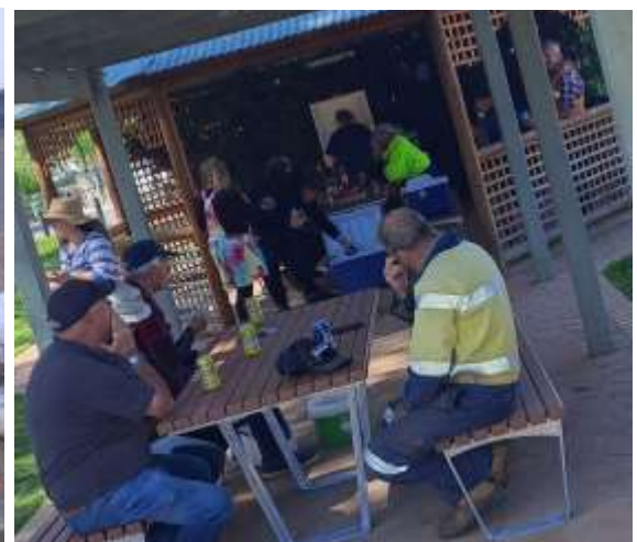
Volunteers enjoying the BBQ lunch afterwards.