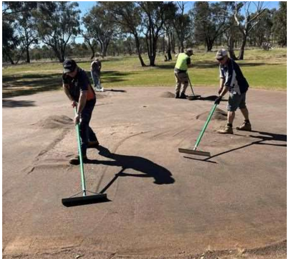
Heaping up the sands.