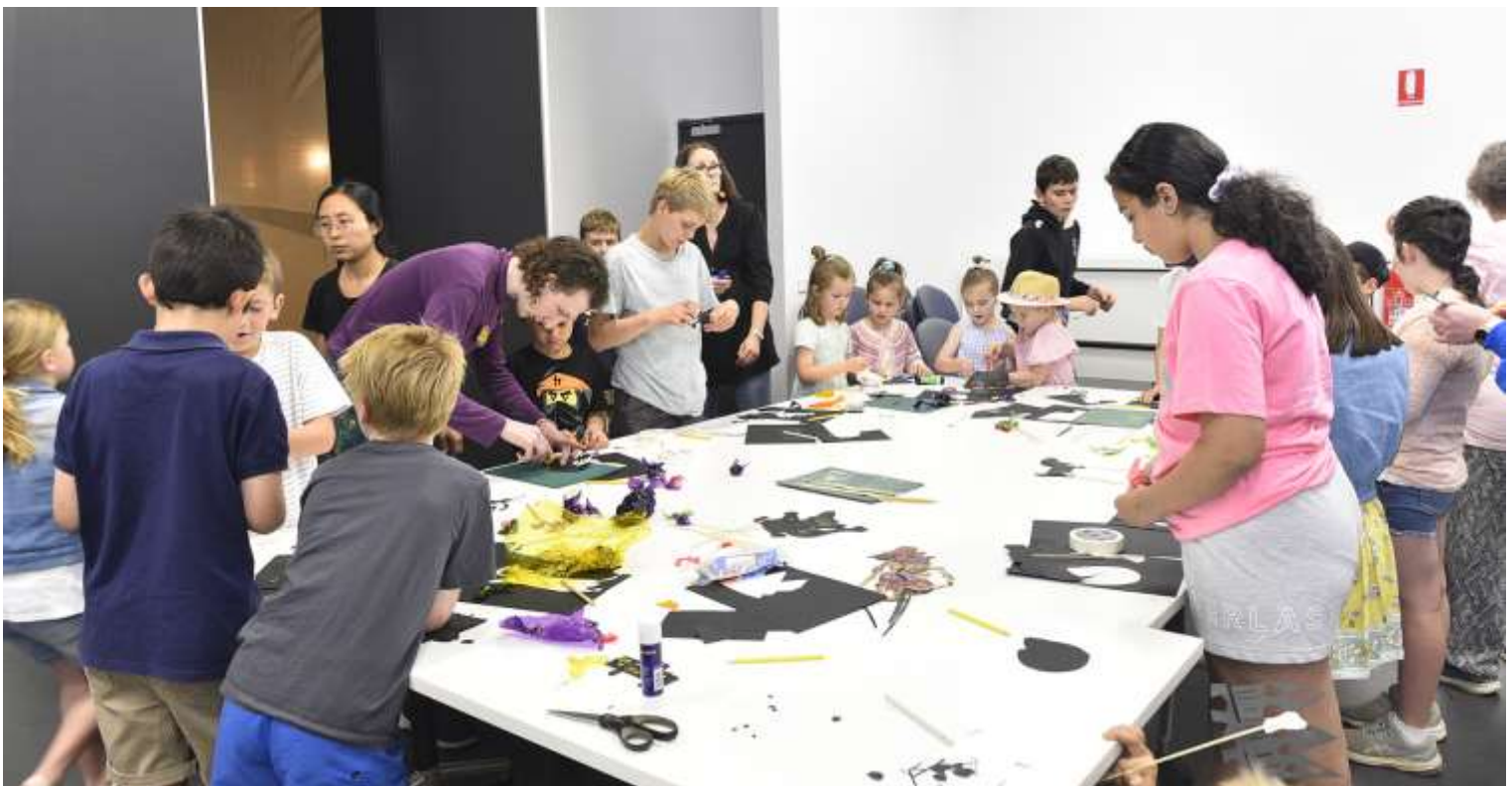
Creativity was the name of the game as workshop attendees launched into their own puppet construction.