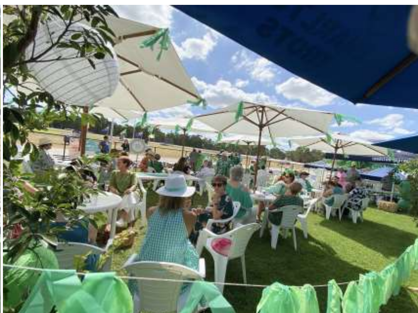
It was a picturesque scene on the Charlton Park concourse as the 2024 "Bubbles in the Bush" event unfolded with the emerald-green theme for St. Patrick's Day.