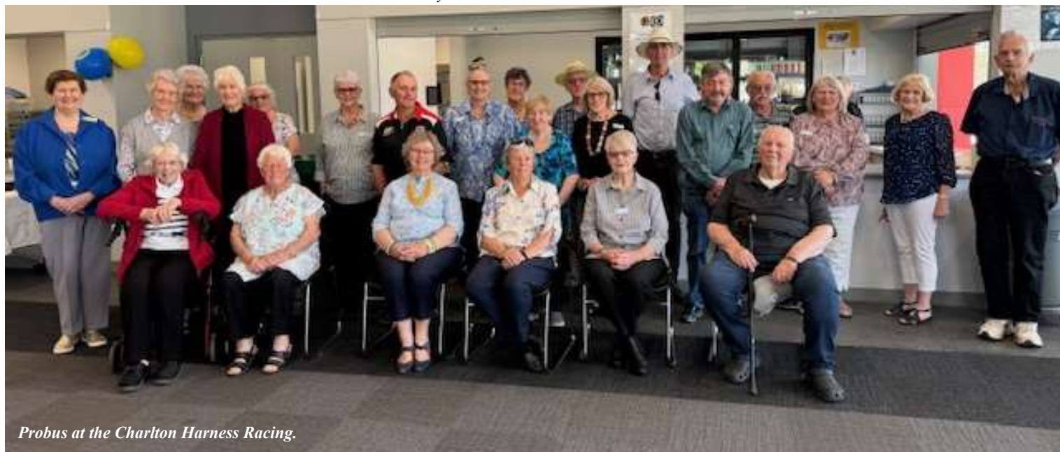
Probus at the Charlton Harness Racing.