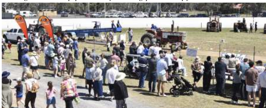
A large crowd gathered to see the tractor pull action unfold and cheer on the competitors.