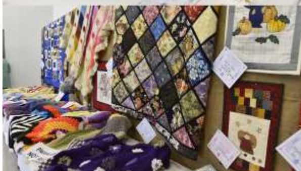
Some of the exquisite handwork and craft work on display in the pavilion.