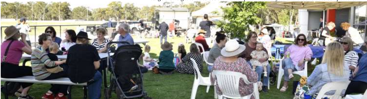
The lawn area was a perfect place for families to gather and unwind before the evening's activities began.