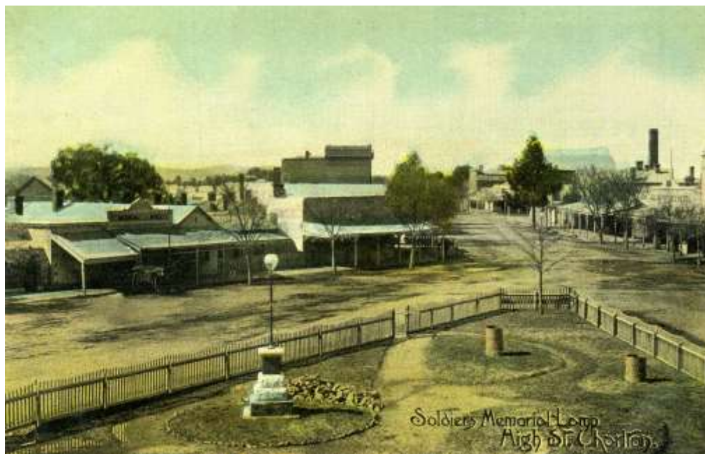
An early photo of the Boer War Memorial which originally had a lamp on top.