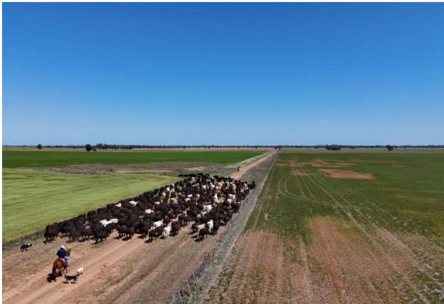
Walking the cattle.