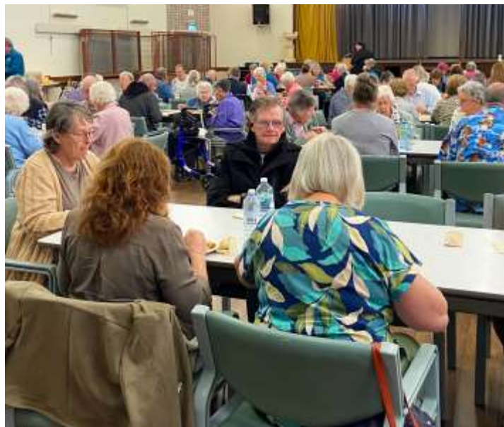
Lunch at the Charlton Hall gave patrons a break between movies and provided an opportunity to mingle.

Given the ongoing feedback, the 2024 Seniors Festival was a day which created lasting memories.