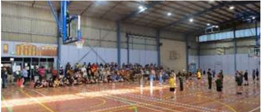
STOMP in the Charlton stadium.