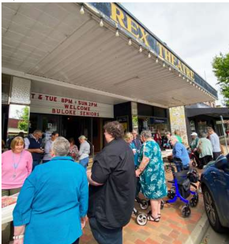
Visitors came from across the region to enjoy a fun day out at The Rex for the Buloke Seniors Festival.