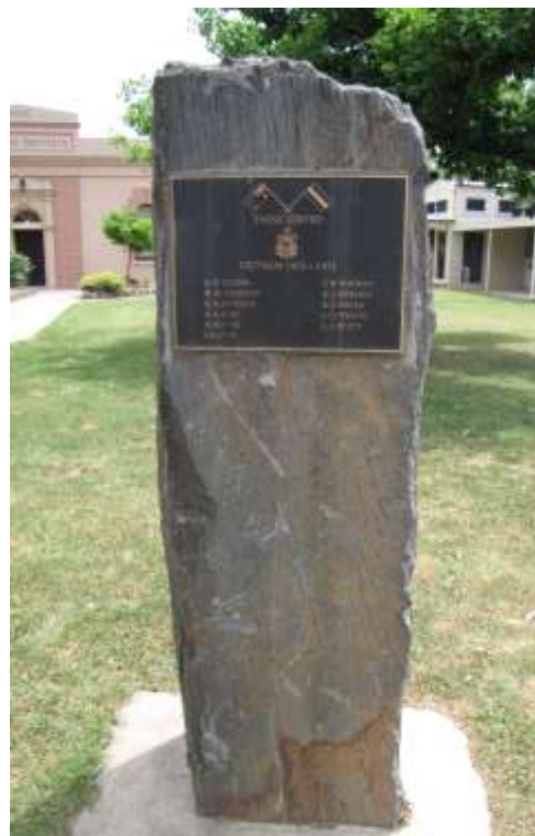
Vietnam War plaque.