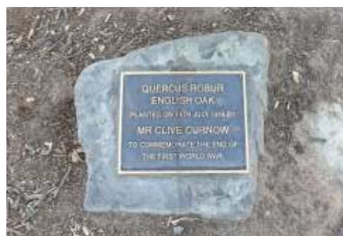
Peace tree plaque.