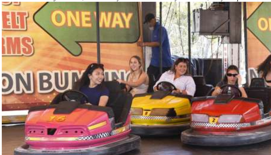
The dodgem rink was a popular activity with a big queue lined up for a ride.