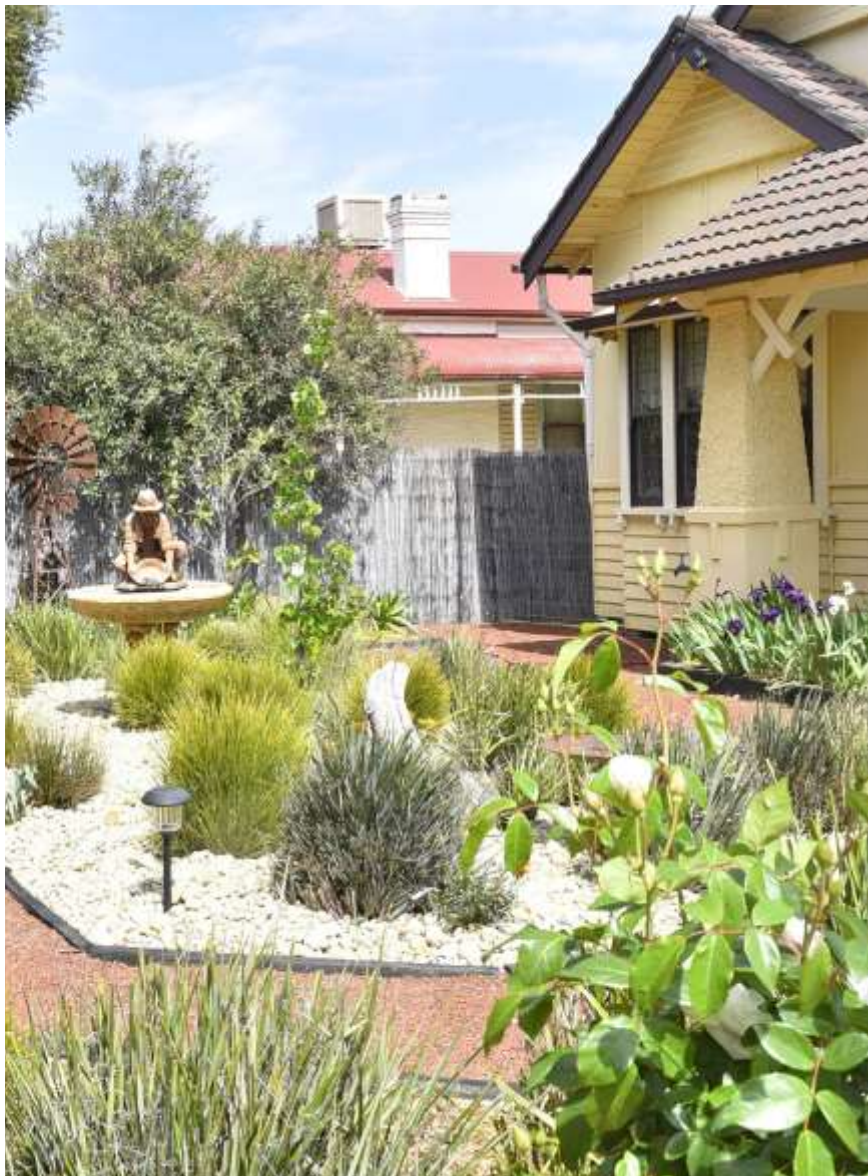
In the space of two years, the front garden of Tanya and Mark Windsor's home has been transformed from an overgrown jungle to a drought-tolerant, low maintenance plot which complements the era of their home.