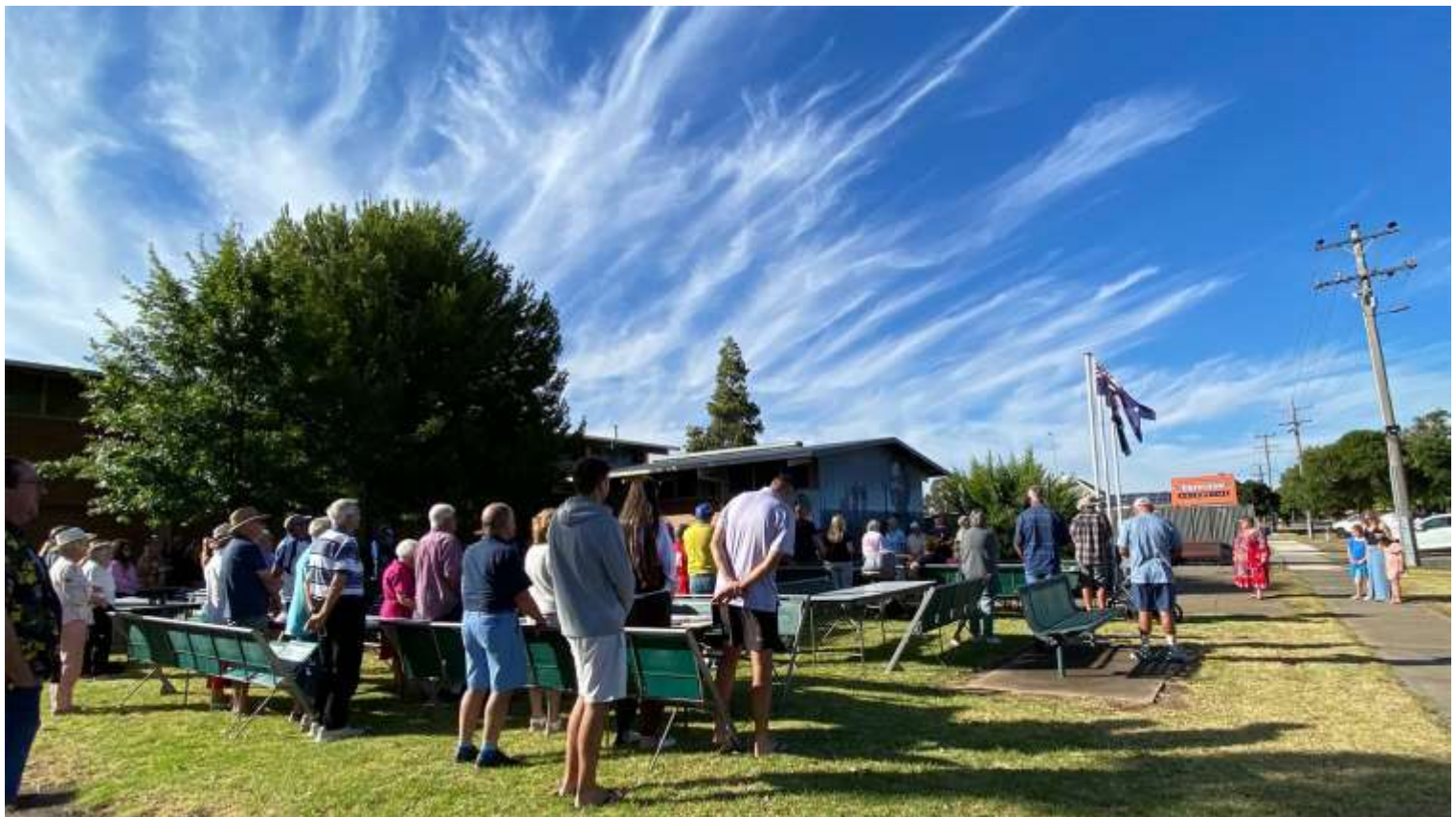
Following the breakfast the crowd stood for the singing of the national anthem outdoors as the Charlton Choir lead proceedings.