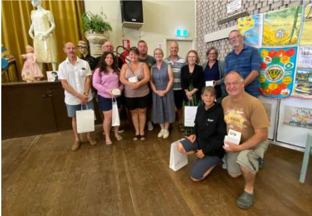
Welcoming and integrating newcomers to town with welcome packs.

The ceremony concluded with the singing of both verses of "Advance Australia Fair".