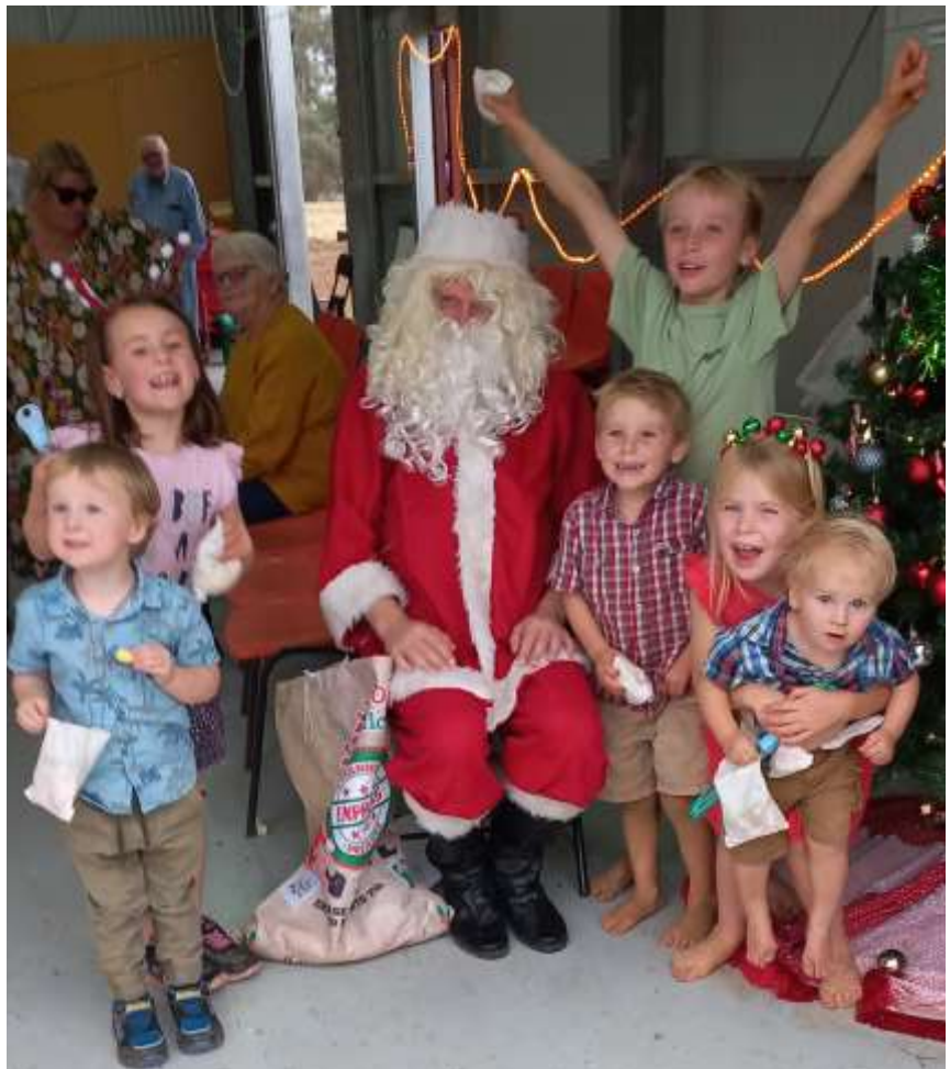
Who doesn't love a visit from Santa?