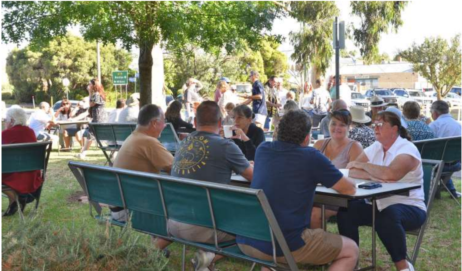
A large crowd attended the Charlton ceremony, enjoying the pleasant outdoor setting for the traditional breakfast.