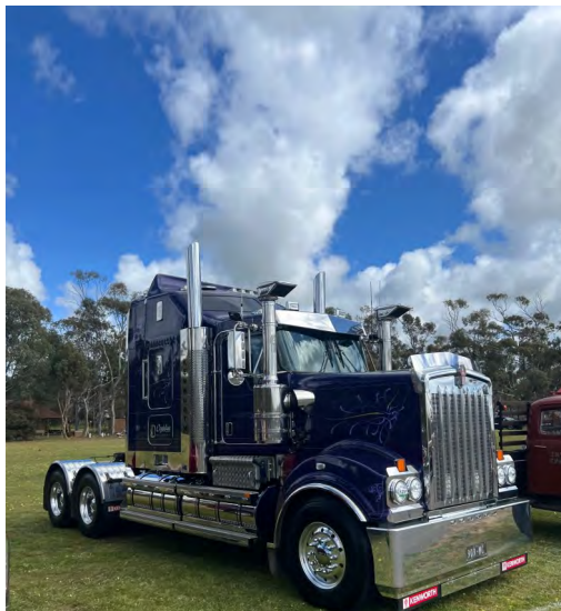
Best Truck Post 1960, Kenworth T909 2023—Nick Coghlan.