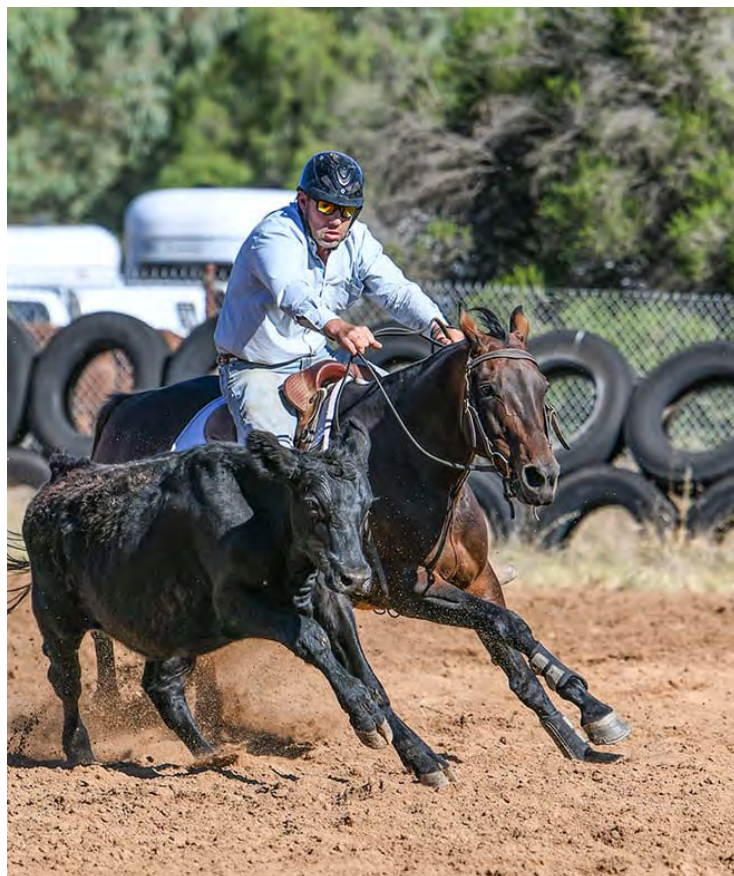
Ash riding Sheahans Legacy.