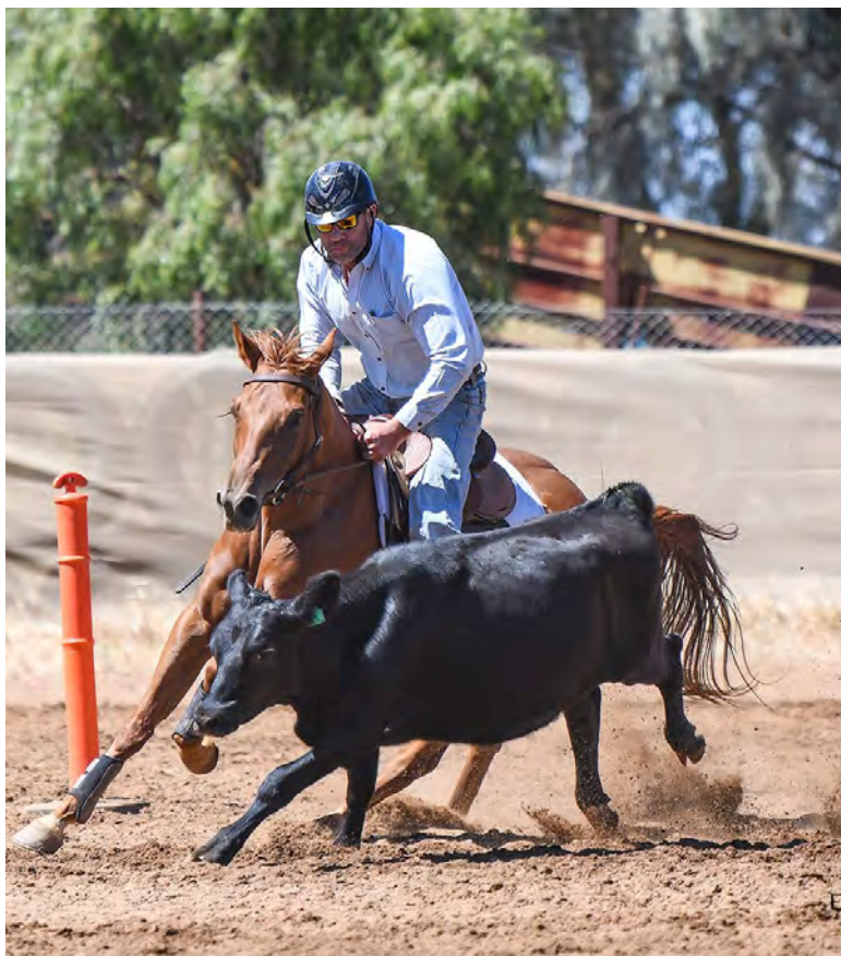
Ash riding Lyra Park Bravos Playgirl.

It's set to be a weekend full of thrills, entertainment, and community spirit — you won't want to miss it!