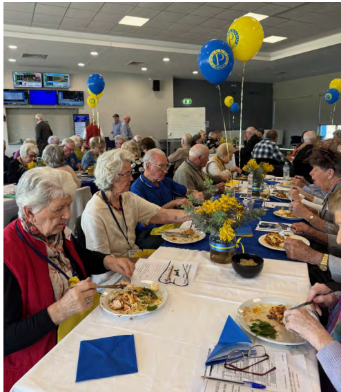
The large Probus crowd enjoying lunch.