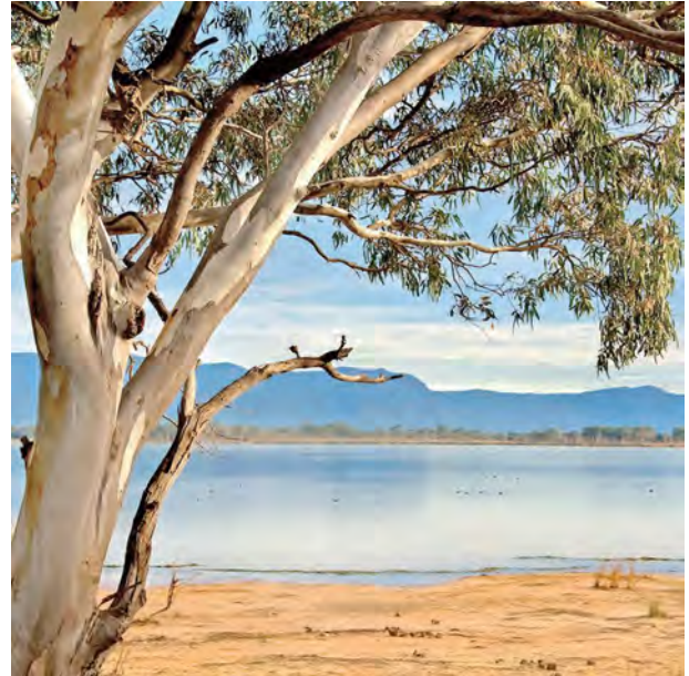
"Lake Fyans" Sponsored by GWMWater.