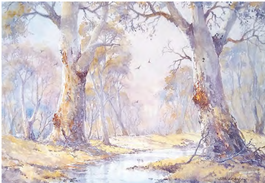
"Peaceful Morning" by Jon Crawley.

Charlton will have multiple events over this weekend full of creativity, community and colour. The Charlton Art and Photography Exhibition, will showcase the incredible creativity within the region, from breathtaking landscapes to the striking portraits and expressive photography. This is a must see event for art lovers of all ages.