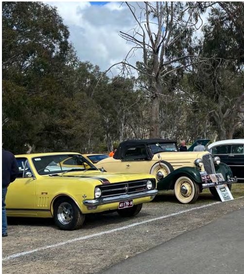
Best Original Car (Steel Bumper) & Best Vintage Car .