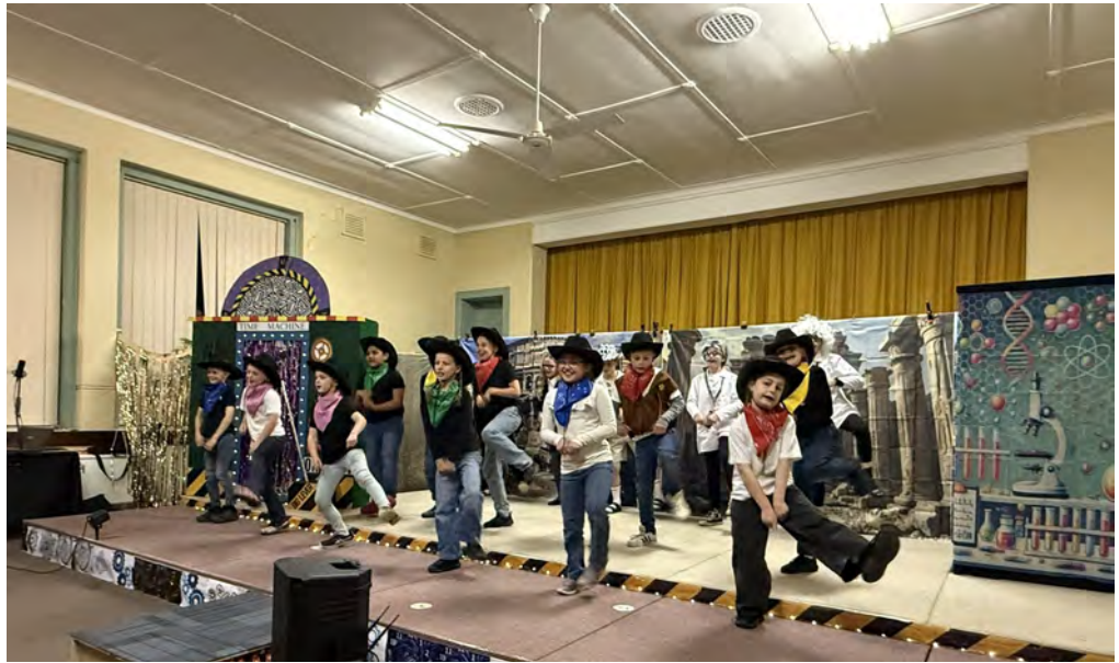
Grade 2/3 Boot Scootin'.