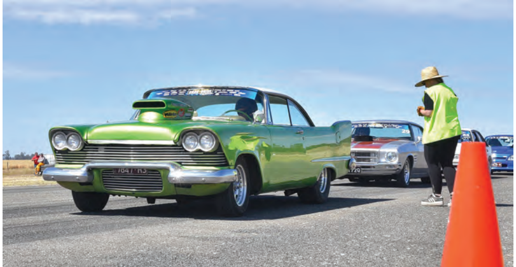
Leigh Robert's eye-catching 1959 Plymouth Belvedere lead the parade back to the pits following heats on Friday morning. The gleaming lime-green vehicle was a sleek example of car styling of that era.

The weekend concluded with a dinner at the East Charlton Hotel where trophies and awards were presented.