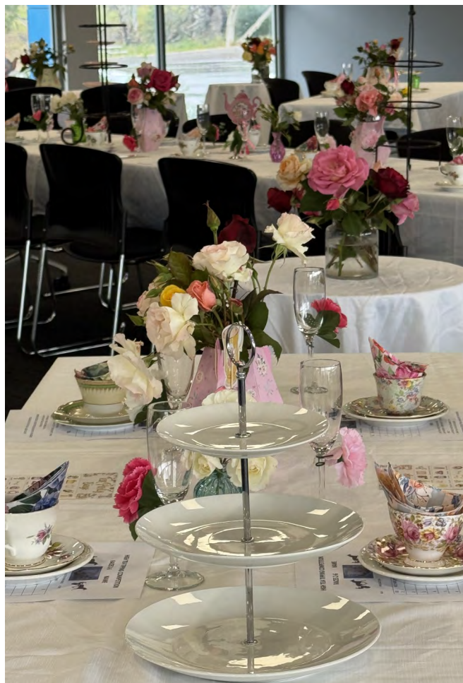
All set up for the High Tea.