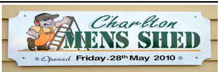
Rabbit/Guinea Pig cage)

Reverend Judi Bird 0435 593 359 judi.bird@bendigoanglican.org.au