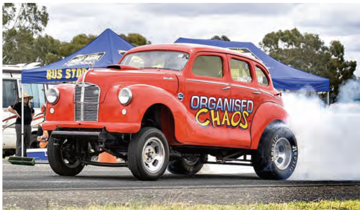
Plenty of vehicles had names, including The Whale, The Fridge and this one of Organised Chaos as the adrenaline rush of the race start spun over.