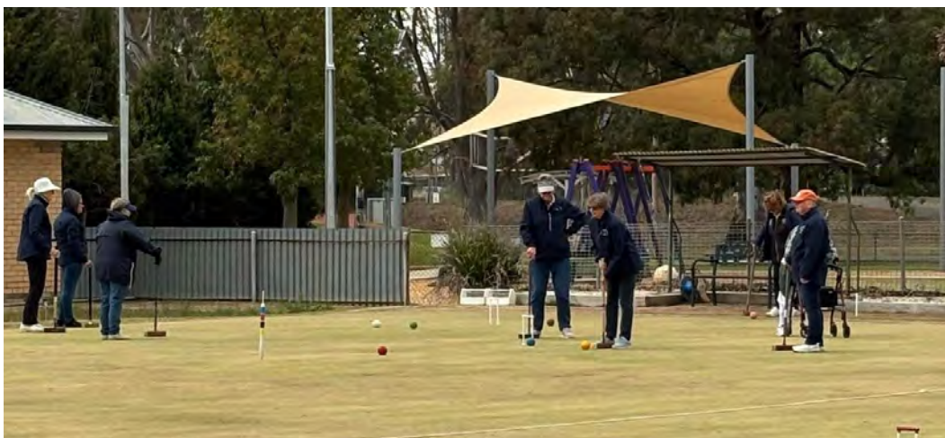
Pennant Break up.