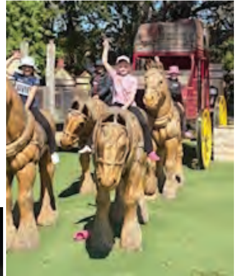
Grade 3/4 at Sovereign Hill.

May the joy and peace of Christmas fill your homes and hearts this holiday season. Wishing all our families a blessed Christmas and a safe New Year!