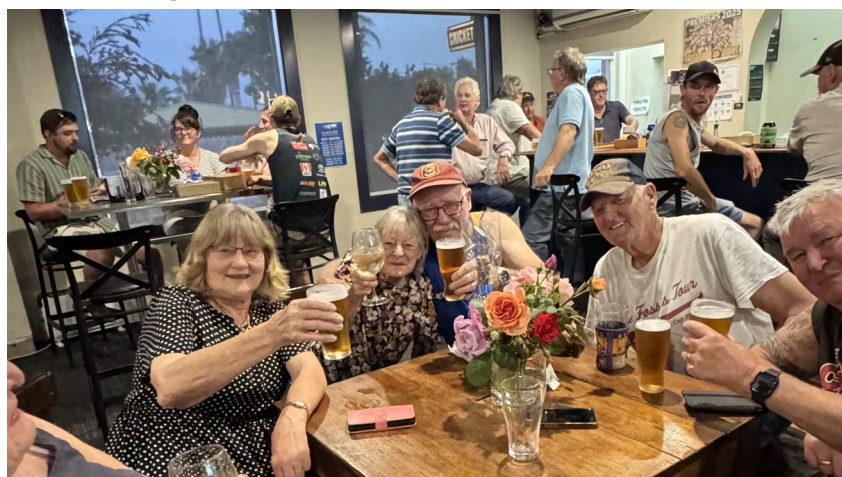
Raffle Night at the Cricket Club Hotel.