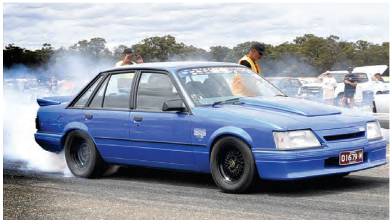
Smoke and noise as contenders rev their engines in readiness for the start of the 200 metre timed sprint at the recent Drag and Drive event.