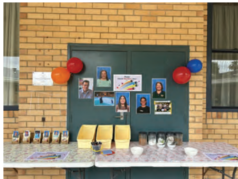
World Teachers' Day.