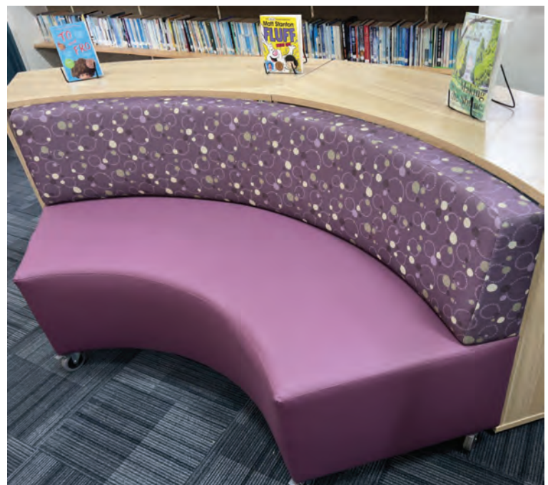
Refurbished Library—comfortable seating.