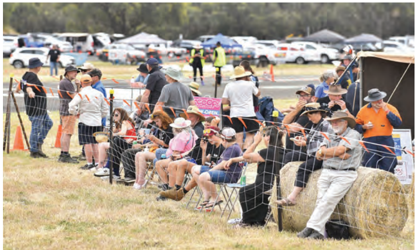
A large crowd of spectators joined the entrants during the Saturday heats - reveling in the exhilaration of the racing.