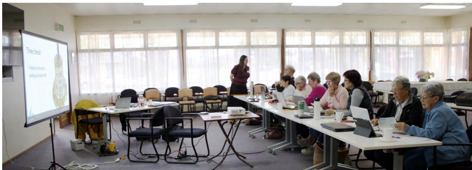
Some of our volunteers taking part in the Victorian Collections Workshop run by the Australian Museum and Galleries Association, partly funded by Buloke Shire Council.