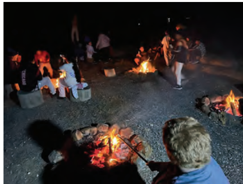
Grade 5/6 cooking damper.