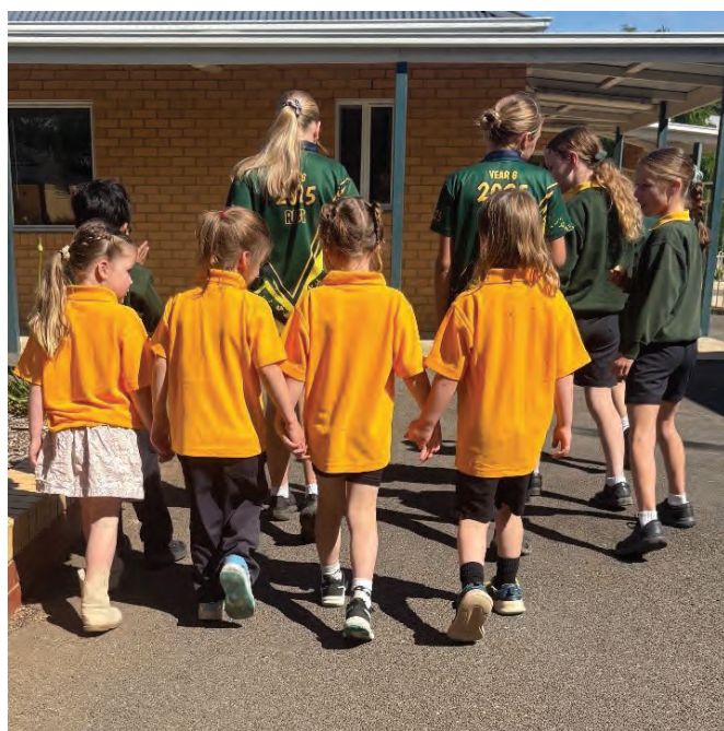
Little Joeys learning the ropes at St Joe's