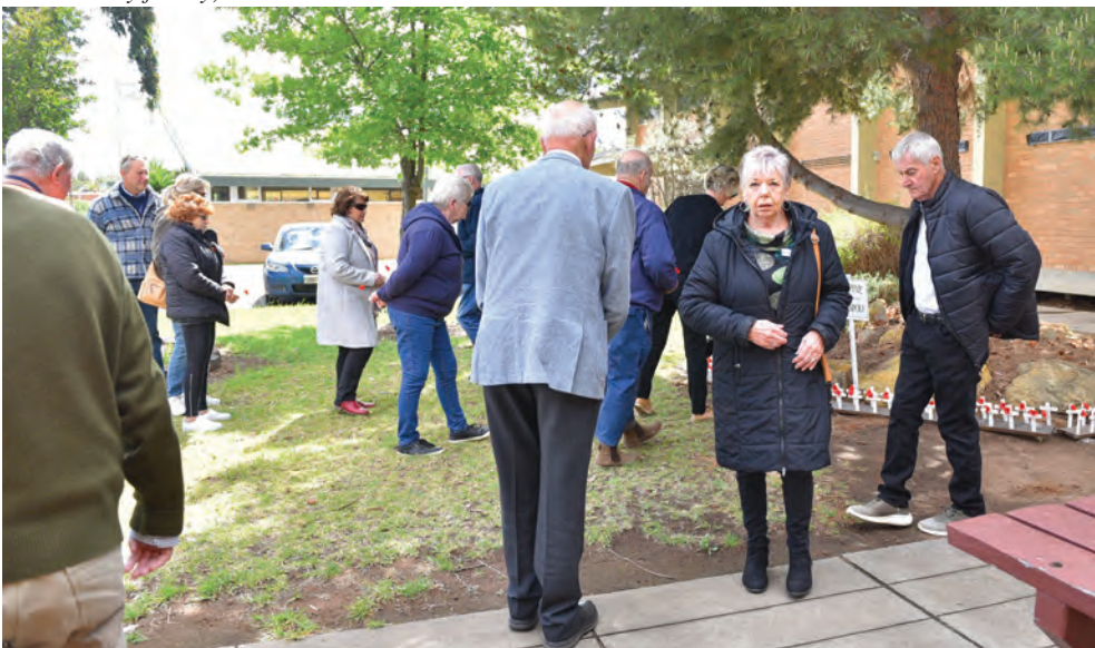
The general public laid poppies in memory of the fallen following a minute's silence at the ceremony.