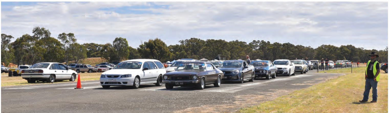
The cars line up in pairs in preparation for racing.