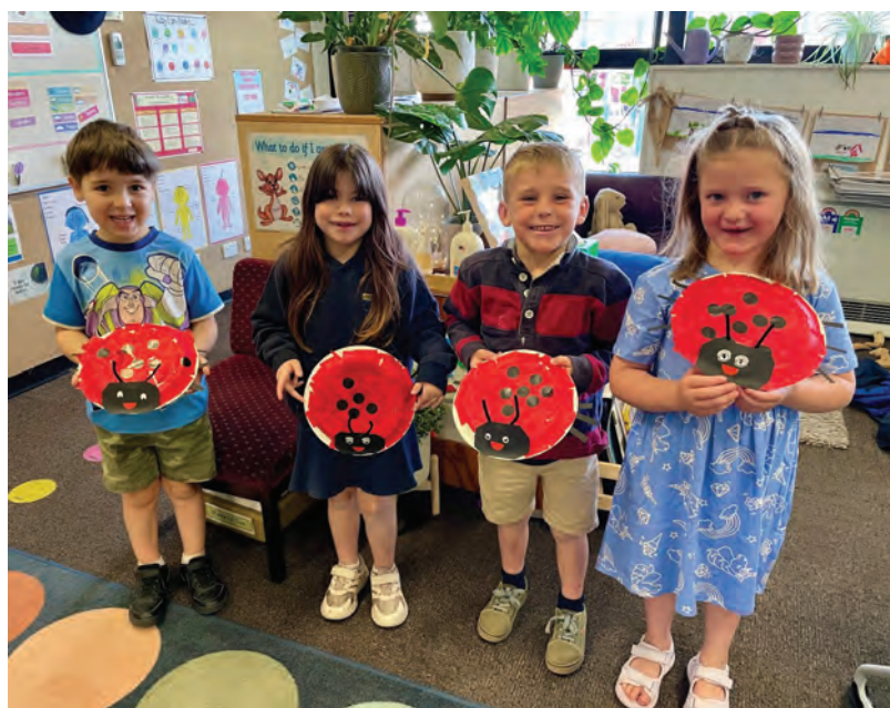
2026 Foundation Transition.